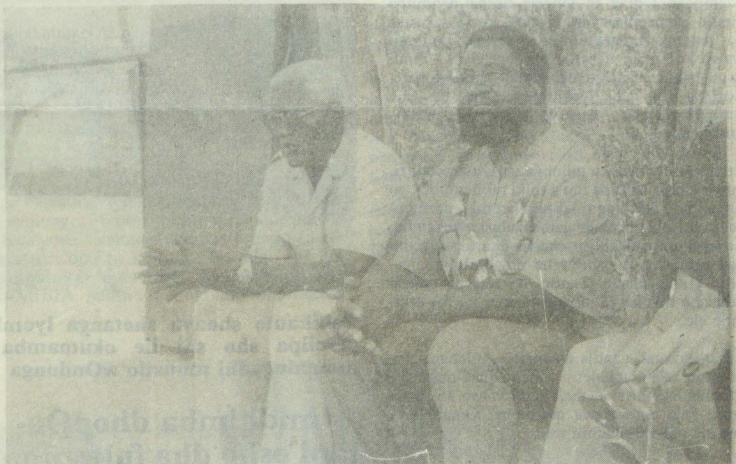
Omukwaniilwa Taapopi a kuutumba mombala ye, pamwe nomumbisofi Dumeni, taa kundathana onkalo yoshilongo pethimbo lyiita

sha eta emanguluko laNamibia, ongudu yoSWAPO.