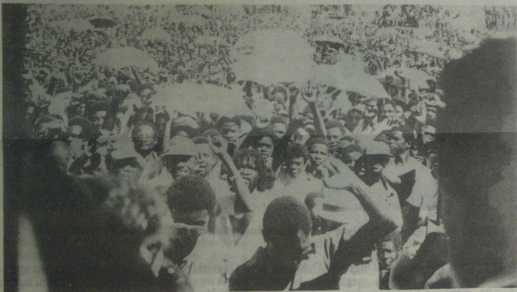
Ongonyo oyo endhindhiliko lyuukumwe mekondjo lyaSWAPO, ihe kaalanduli ya SA oyo etukano enene, oshoka ehalakano pamulandu gwawo esimano, onke ongonyo tayi dhengitha oshigwana

Okambo oka gandja wo u uyelele uuna ya pumbwa okufala oshinima shoye miihokolola, mpoka u na okutameka naampoka u na okuhulila. Oveta onti 5 mokambo hoka otayi popi nakutsipulwa eho nenge a lemanekwa uulema tau kalelele, kutya ota futwa etata lyomwenyo gwe. Shoka otashi ti ota