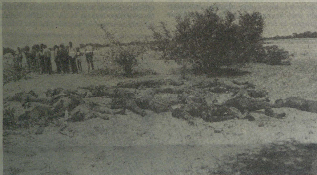
Omidhimba 21 odha lala mpaka omasiku gane pwaa na ekwatho lyasha. Aakalimo yomomudhingoloko oye na omalimbililo kutya omidhimba haadhihe dhetanga lyaSWAPO.

“Okafimbo kanini ashike eshi ka pita po onda uda eendjebo tadi topa, ame nonda yandja ovamwange meke laKalunga nonda faduka po,” osho a hokololela Omukwetu. Olwoodi olo ovanhu vomomudingonoko tava ti kutya ola ka xula konhatu yokomatango, ola fiya po omidimba dovakwaita vaSWAPO 21. Onghendabala yoshiwana ketanga leameno nokovapolifi omidimba di fudikwe, inai kwafa sha fiyo ovakwashiwana ve likwatela ko voovene.