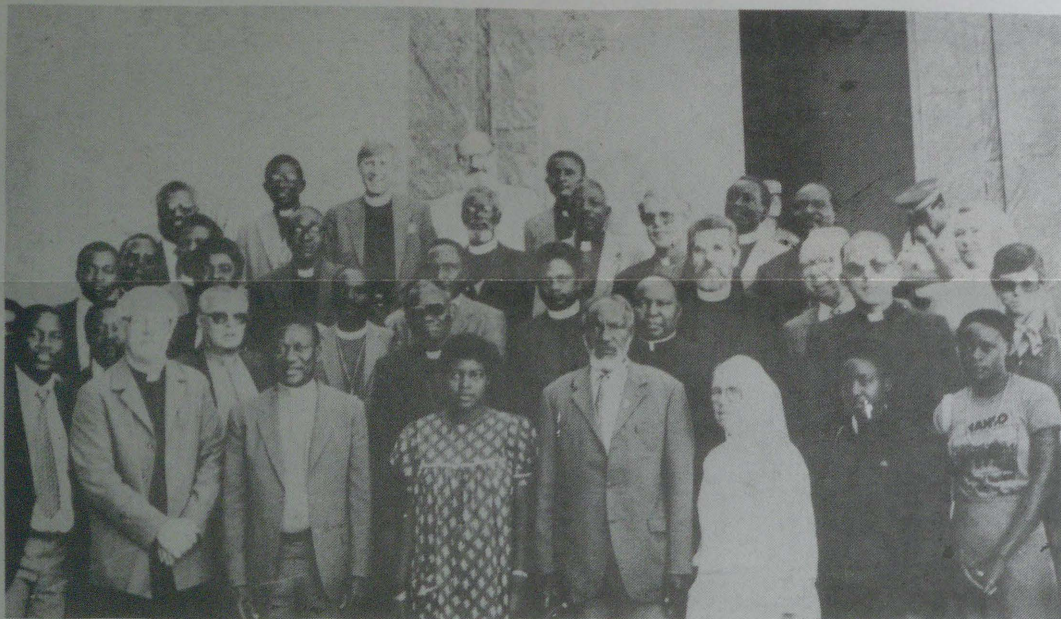
Ongundu ndjika oya tegelela pomweelo gwohofa, oshipotha shoveta yuusiku shi hite mo ongula yeti 29.10.1986 mOvenduka.

Shiivifa oinima yoye mO-MUKWETU, nowa hanga omunhu keshe wa hala!