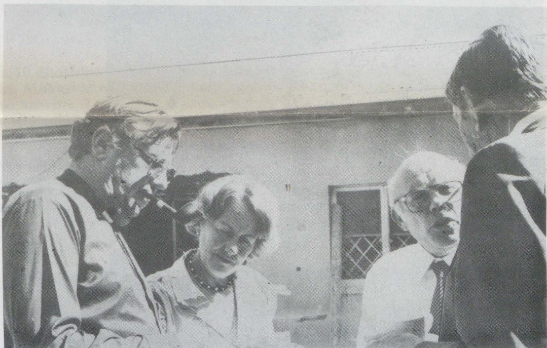
Ovakalelipo vOngeleki yOvandowishi moshooongalelekeleki sha VELKSWA neudo mOvenduka pefimbo lokafudo.

yeengelekishilyo li holoke. Vahapu ova itavela kutya ngeenge kali po, onghatu yotete inai katukwa natango oyo tai ka shikulwa keenghatu domayovi tadi tauluka oimbide nomaupyakadi mondjila yehengumukilomumwe.