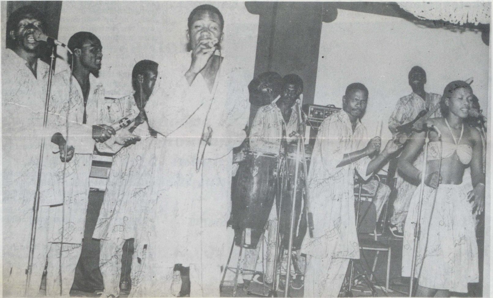
Eputudho alihe lyaagundjuka yomuupongekwa pondje yoshilongo olya kwatelela mo oshitopolwa shomithigululwakalo dhoshigwana shawo. Methano ndika otamu monika ongundu yomithigululwakalo yedhina Ndilimani. (Ndiliman Cultural)