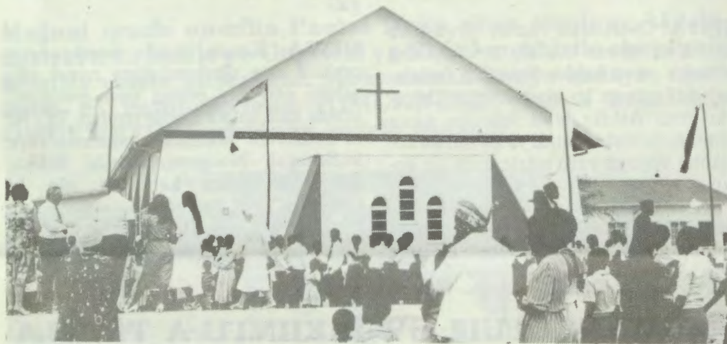
Etungo lyongeleka yaKatoolika kaRooma mOvalombola

Ongeleka yotetetete modoolopa ipe mOvalombola, popepi nOngwediva, mOwambo, oya yapulilwa oshilonga shayo 27.10.1984. Eyapulo ola ningwa komubishofi waKatoolika kaRooma, Bonifatius Haushiku, osheshi etungo olo olavo.