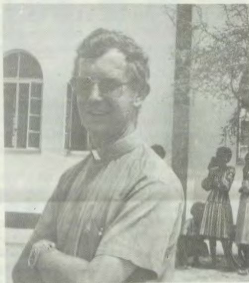
Pata Franz Houben ngoka a kala mOkatana uule womimvo 10.