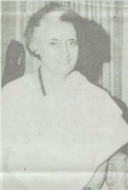
Oministeli yotango efolo Indira Gandhi