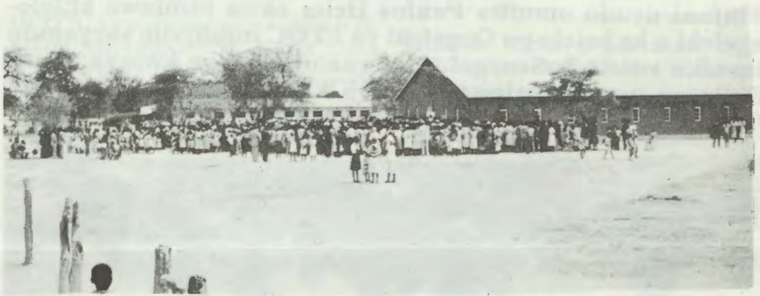
Fimbo ongeleka inai yeululwa, ovanhu ova li va ngudumana poshivelo shayo nokwimba nokulesha yo eendjovo daKalunga mOmbibeli.