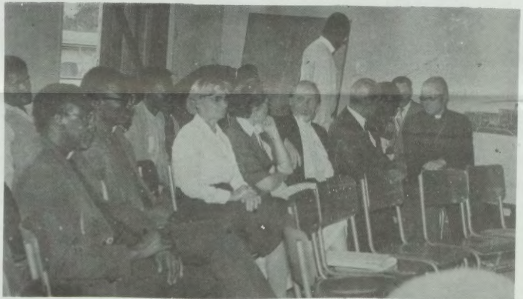
Moshigongingeleki sha zi ko

Elongitho lyomauthomango omape, olya kwatelela mo etendo lyiikandjungeleki yopaumbisofi, kokutya iikandjo mbyoka yi na okulangekwa aambisofi. Iilyo yimwe yoshigongi oya holola omadhiladhilo gawo moshinima shoka,