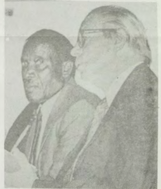
Mefano ndika kolulyo, omusita Beyers Naude

Shika oshimwe shomiiningwanima oyindji iiwinayi e yi ningilwa mokati koshigwana