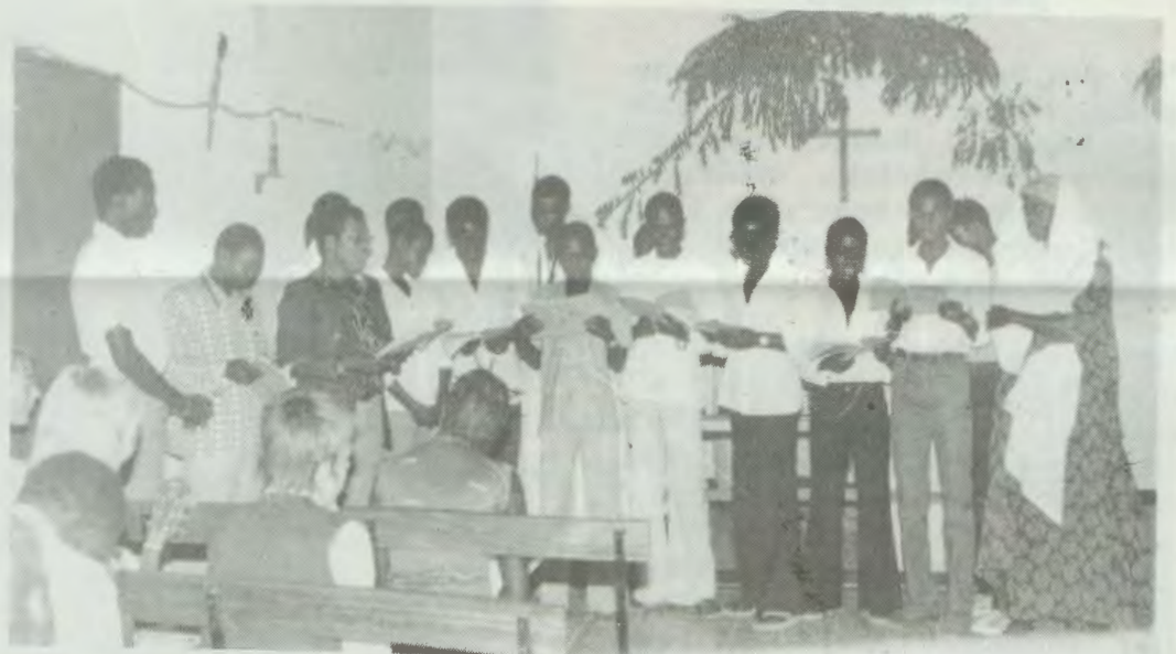
Omudo 1980, osho ongudu yovaitaveli mepyatumo laSenegal ya li ya dana oshivilo shaKrisimesa