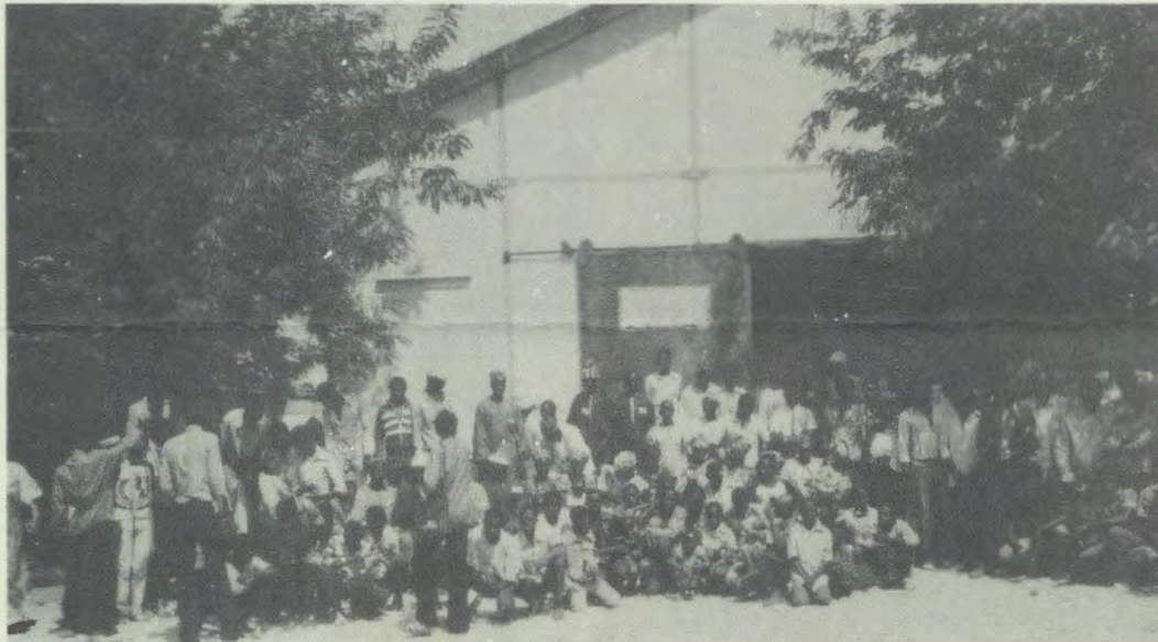
Oshoongalele shovakriste muSenegal