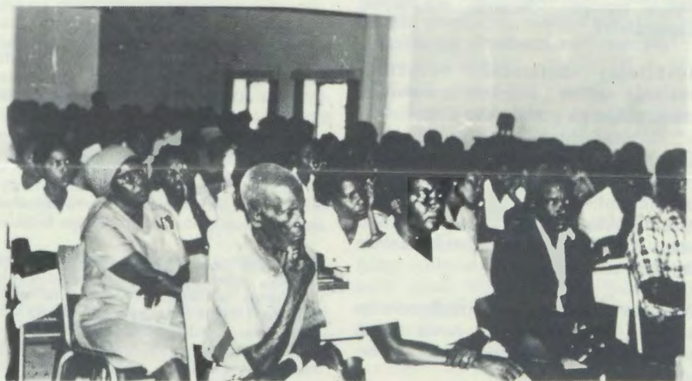
Aanashilonga oya li taa pulakene neitulomo okatya kehe ndohotola te ka tumbula