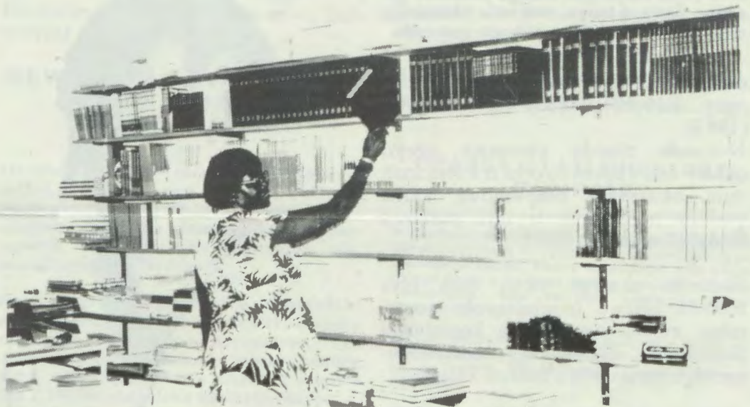
Okuza omumvo 1963 pehulilo, meme A-K. Kapenda okwa longo nelanditho lyomambo. Oye okwa kala lumwe mokersesa yaatooli yoonkundana. Ngashingeyi oye omuwiliki gwOsitola yomambo nomudhiginini gwiiniwe yOshinyanyangidho. Methano ndika oye ta tula nawa omambo melangulathano.