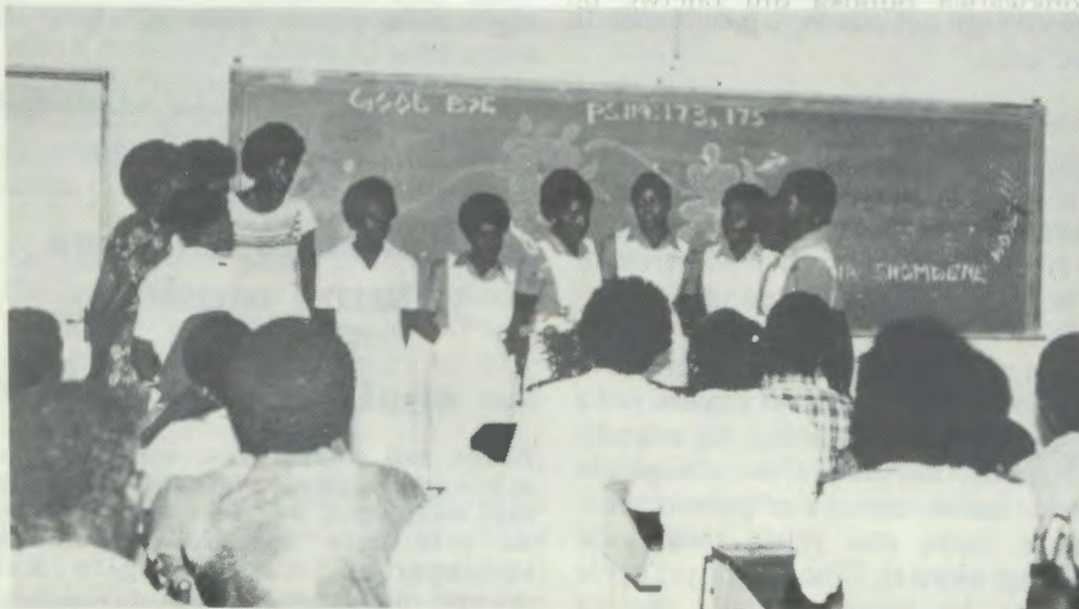
Okangundu kamwe kaalongwapangi mOnandjokwe taki imbi eimbilo lyelaleko lyandohotola Hamata.

Elekelo laye kOvanandjokwe, omunhu oto dulu oku li talela moitukulwa ivali; eshivifo lombilive yelekelo koihakulilo aishe noshipopwiwa sho vene kovap-wilikini.