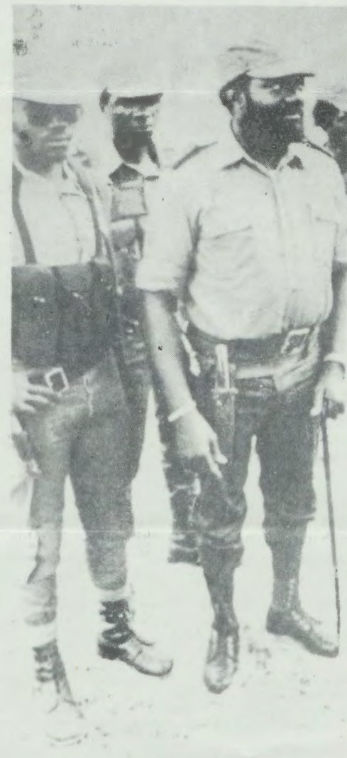
Omuwiliki gwongundu yaUnita, dr Jonas Savimbi, komeholela

“Mokwiikwatelela koshikalimo shehempululo ndiyaka lyomuFebuluali, otatu shi endulula ishewe, kutya eikuthomo lyaakwiita yaCuba muAngola, otali ka tamekwa kutse yene meithikameno lyiilongo yetu, tashi ka ningwa