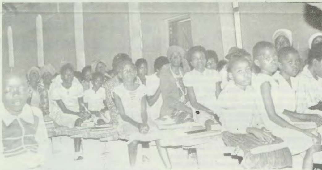
Pomathimbo gamwe uunona owa kala tau loloka notau kotha. Tala ngoka kolumoho lwoye, ihe esiloshimpwiyu lyawo olya li enene opo waa kotha ashike.