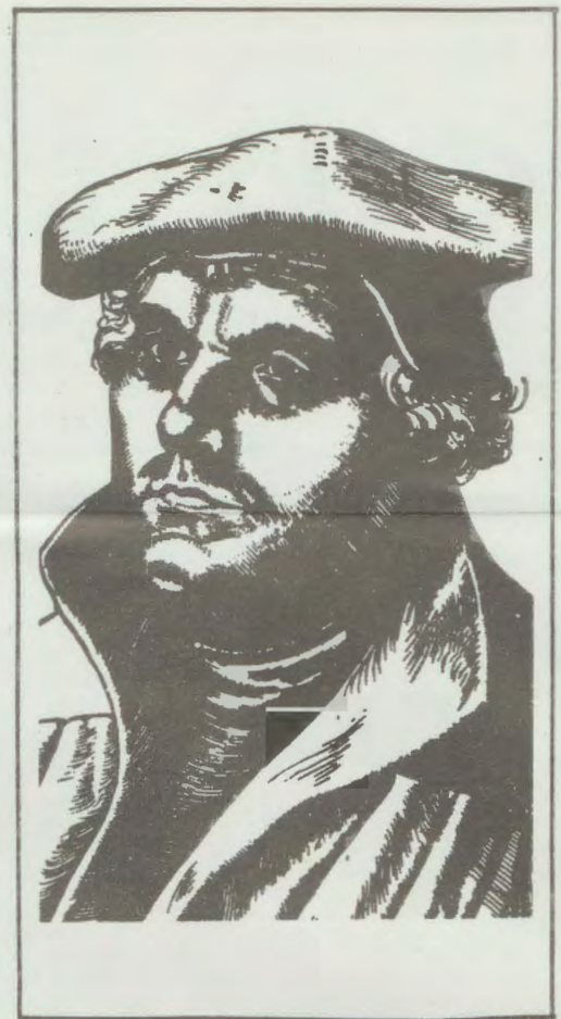
Dr Martin Luther

Omukundu gwonena ogwo nguka; otye ta kwatha ndje ndi kale ndi na omwenyo? Eyamukulo mpaka oli vule eliko nenge uundjolowe. Eyukipalitho lyomulunde koshipala shaKalunga oyo lya shiga ko. Kalunga okwa hala uusasei wooitaali ayehe. Kalunga okuhole aantu ayehe.