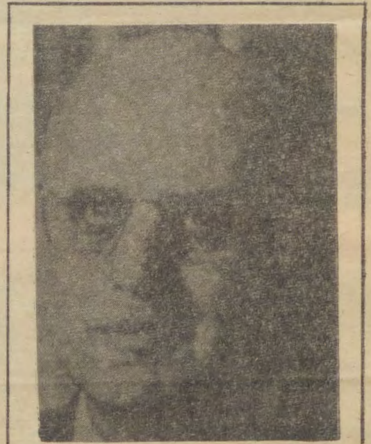
P. W. Botha, omuleli gwa SA.

Pamushangwahokololo ngoka gwa gandjwa kiilo-ngo itano, gu taandelithwe miilyo yOraata yega-meno ya VVO, ongomukanka ngoka omaikundo agehe ga tsu kumwe musho, omwa tiwa;