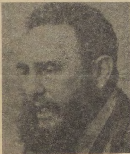
Fidel Castro, omuleli gwaCuba

Ndjayi Prem Chand gwaIndia, natango oye ta tu- lwa omukuluntu gwaakwiita ya VVO, mboka taa tengenekwa 7,500 ngele oyendji.