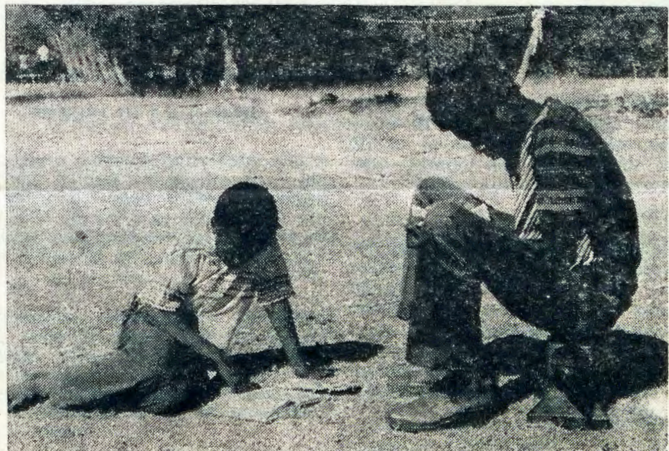
Valihongi ovafimanekwa, omitwe nadi topé kokulesha omambo

Ayehe mboka ya tuma omambo ga- wo kOshinyanyangidho, Ombimbe- li, Omaimbilo nuumbo ulwe, opo ga opalekwe, otaa dhimbuluthwa ishewe nokwiindilwa, opo yi ile ko omambo gawo— oga pwa nale okwoopalekwa.