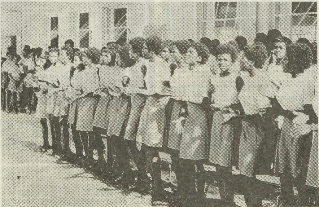
Yamwe yomaanasikola mOsekundosikola yaNgandjera, pethimbo lyoshitu-thi shokweegulula omatungo omape. Osikola ndjika ohayi longo aamati naakadhona. Ehokololo lya udha tala kep. 5.

Ndika etameko ewanawa kutya Aaluudhe nAatiligane ya kale pamwe momalongelokalunga, miigongi nomoompito dhi ili nodhi ili dhopankalathano yesiku kehe-ongaantu naumwayinathana.