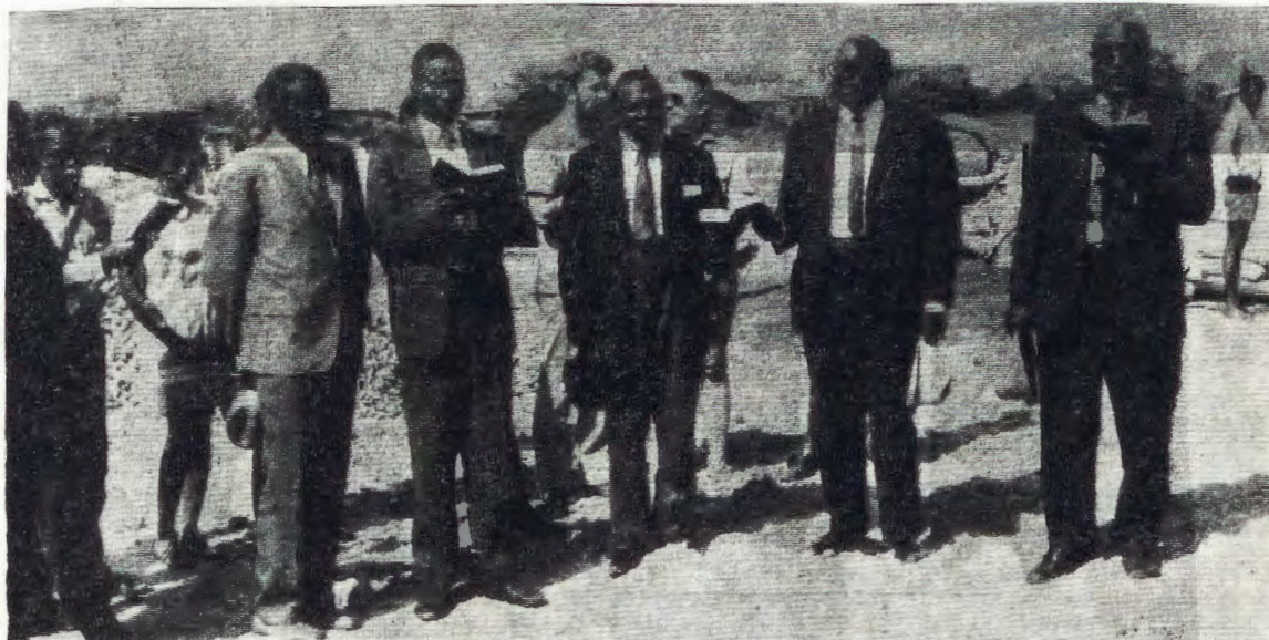
lilyo yEpangelongeleka Iya Elok moshituthi shokutula Ondhopi yokolonela metamekotungo Iyoshinyanyangidho oshiye pOniipa.

—Kutya Ongeleki sho yi li aluhe omukondjithi gwelongitho Iyoonkondo, oyi na natango etegameno Iyomukundu nguka gu ka manwe po nomukalo gwombili.