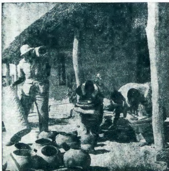
Ohatu longele tuu oMwene wetu?

OVANJASHA vakwetu, onda hala ku mu pula sho shi li momwenyo uange: otu nokuninga ngahelipi opo eendjovo da Kalunga di fike kovanyasha ovakwetu ovakwanghala?