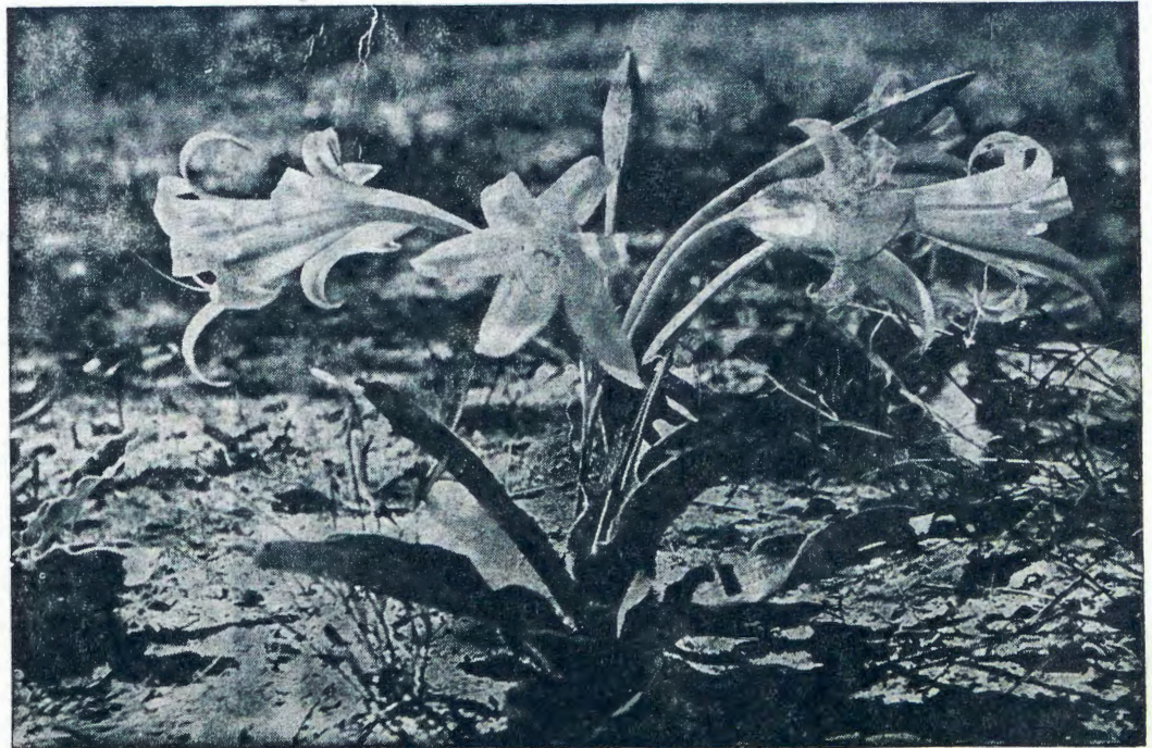
Uusita wokombuga wa talala, noondundu odhi izaleke enyanyu

Omadiladilo oo e li yo movakulunhu va Rodesia loumbuwanhu, tava kwatelwa komesho komusamane Field no momupangeli Kaunda wokoRodesia loumbangalanhu. Oilongo ivali ei opo ya mona omapangelo mape.