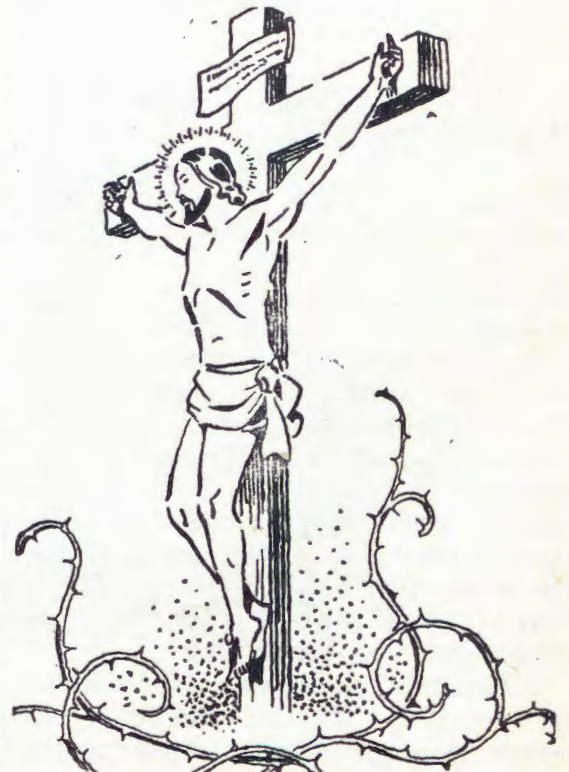
Ongame nge tandi yeluthwa mevi, ayehe otandi ya hili ku ngame