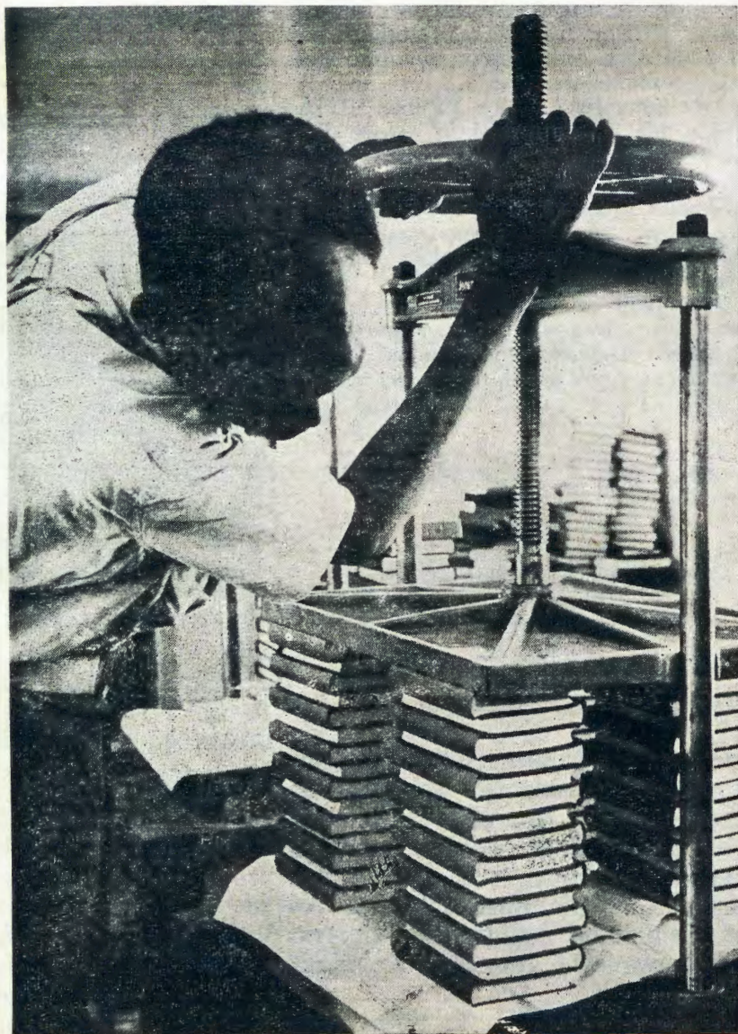
Mefano eli hatu mono umwe oo ta vyula nawa omambo opo a kale a wapalela nawa okulongifwa.

Ope na oinyolwa. yopamhumbwe yolutu. Ngashi Jesus a velula nokwa kutifa omalutu, osho oinyolwa nai kume yo omhumbwe yomunhu yoko- lutu. Elaka lokunyola nali tungilwe ketindi nokonduko yonghalo, yeshiivo noyeendunge domuleshi. Eshi otashi kwafa omuleshi, a ude ko osho te shi lesa noku ude ko omulombo wEva- ngeli kehuli laye kwi.