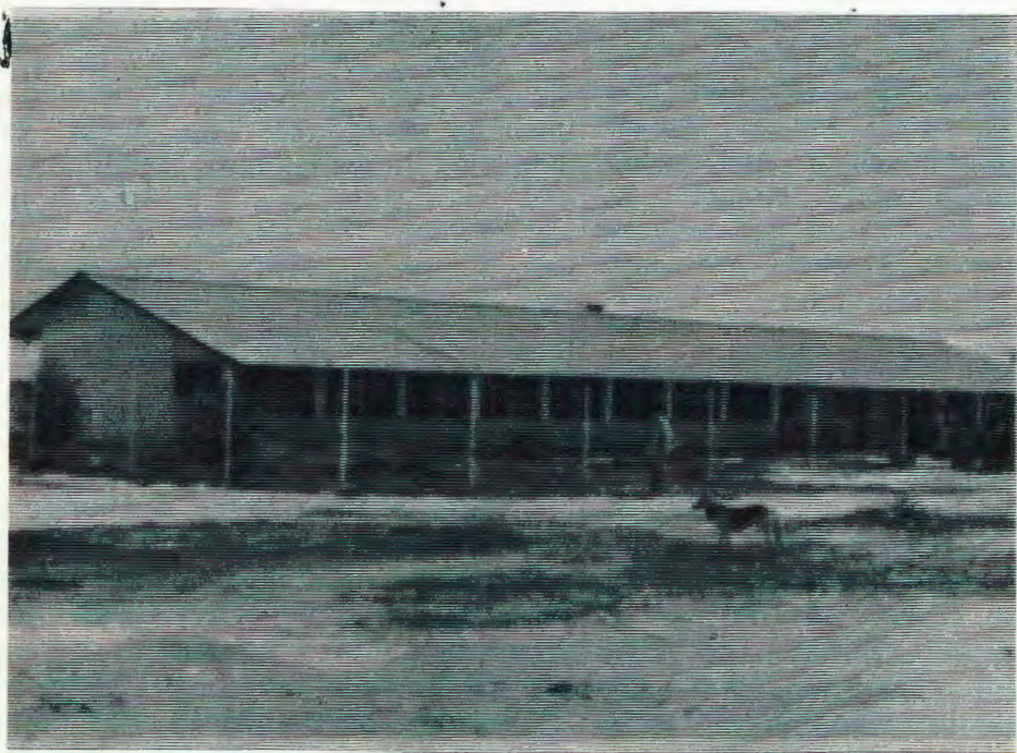
Mongulu ndjika ompe tamu lala aavu yomavu gomukwau.

Monandjokwe omu na wo ongu- lu ndjika, noyo onene yi thike poyo- kanyothi. Oya tungithwa wo niimaliwa ya zi kOngongahangano yaakwaLuthe- ri. Oya tungwa nuunkulungu owindji. Aavu yomavu gomukwau ohaa lala muka, kehe gumwe peha lye li i-