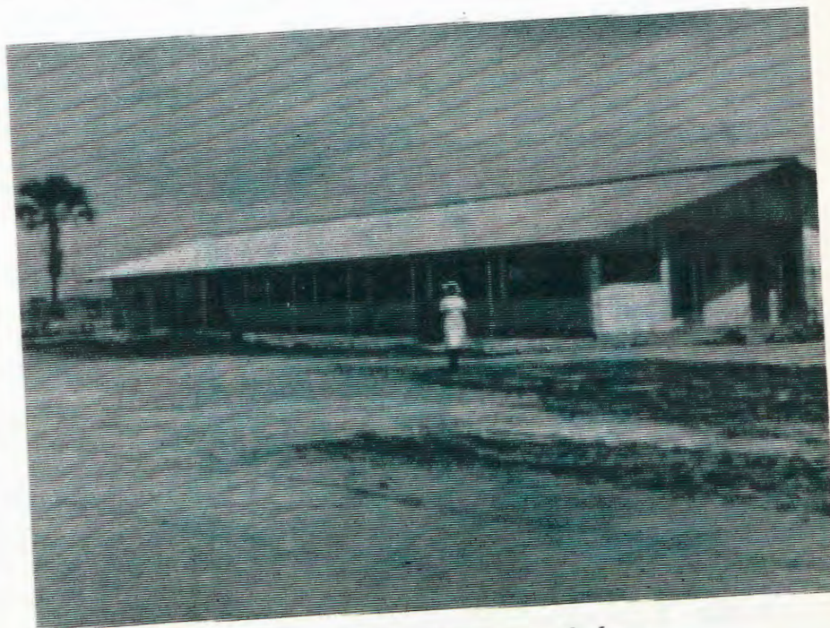
Ongulu ompe Okanyothi mOnandjokwe.

Ofuto yevalo R1.00, ofuto yokualitha mesiku kehe pamwe nombete niikulya oyo 10c. Aayenda taa pitikwa okutalela po aakwawo potundi 10-11. 30 ashike. Aapangi oye niilonga oyindji, onke ethimbo lyu uthwalokutalela po nali dhigininwe. Aasimba taye ya kokanyothi, taa etelele uukalata wawo. Mboka ye li manga metegelelo, otaa konakonwa natangomokanyothi okakulu metine moshiwike kehe.