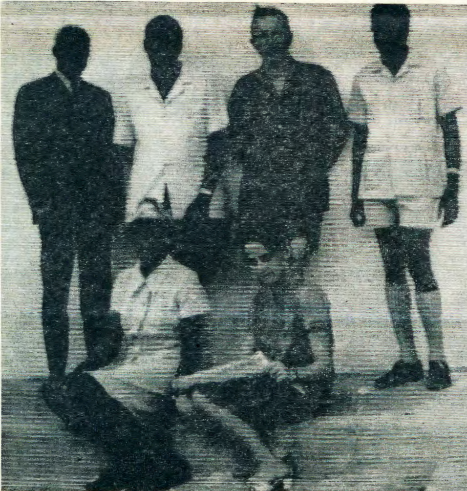
Aanashilonga yamwe naayakuli yomongerki yaElok. Pethimbo lyoshigongi shika oshilonga shoshifo shOngerki osha kundathanwa wo kuyo nkene shi na okuthikitha elaka lyasho kaaleshi.