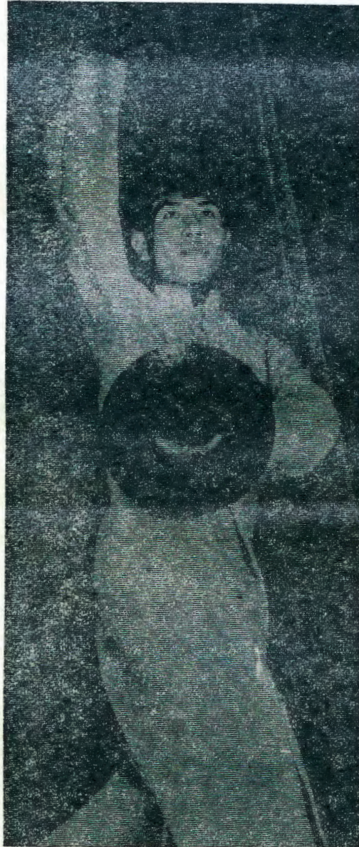
Pethimbo lyohungi onene yoshigongi, omwiilongi muuteologi okwa ulike omukalo gwawo okwiimbitha oongalo ngashi dhi li kiikaha yawo.

adhihe muuyuni ndjoka tayi landula mpaka: