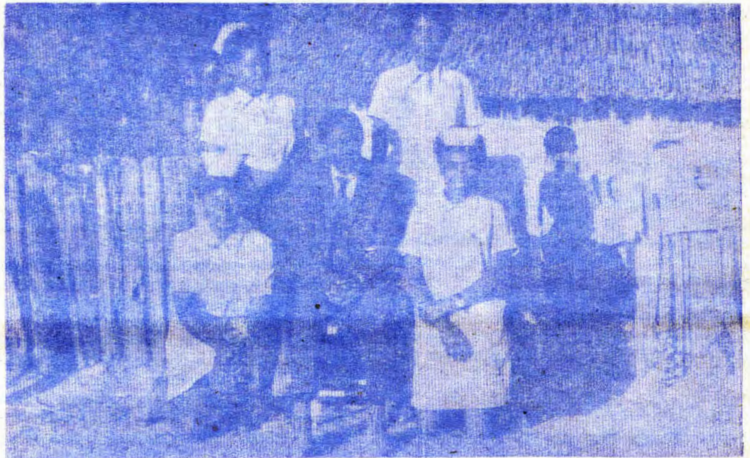
Aapangi yomoshipangelo shaKahandja otaa kunditha aanashilonga ooyakwawo noku ya halela Okrismesa ombwanawa.

Epangelongerki lyeti 5.9.1972, olya utha aayevangeliste aakulu 12 yamwe haa longo mUushimba nayamwe mOwambo, ya ka kale melongekidho ndika. Shoka osha ningi eyamukulo lyompumbwe ndjoka ya dhiladhilwa kEpangelongerki ethimbo ele. Elongekidho ndika itali ka kala pamwe naasita taa putudhwa mOsikola yuuteologi yuukumwe mOtjimbingwe.