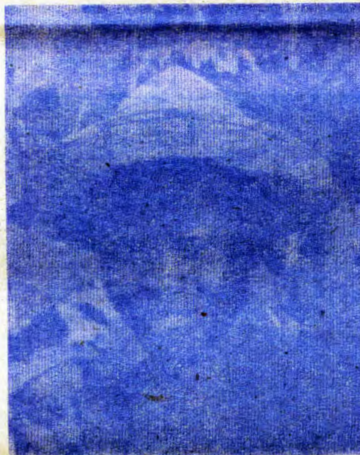
Omulongi Viktoria Shituula, Okahao