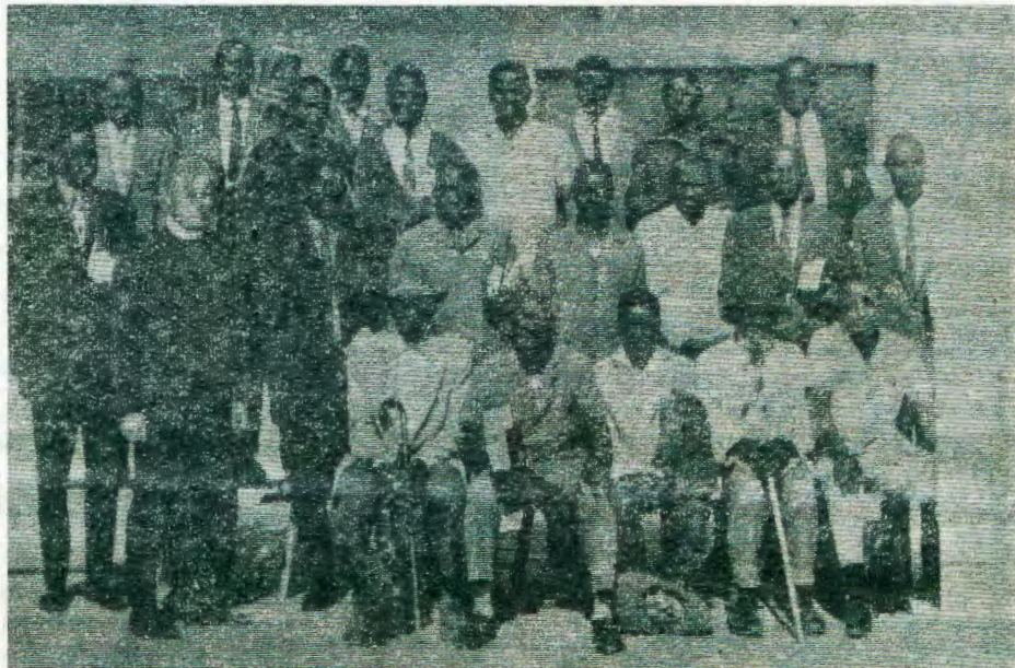
Omaongalo mahapu neudo okwa mona ekwafo nouputa muhapu omolwoyoongalele yovanashilonga ei tai wilikwa kutate Toivo Pentikainen mongerki ei. Oshoongalele sha fimana sha kala meshikulafano lomalweendo a tate Pentikainen oshokutwa o- valumenu omukumo pefimbo eli meitavelo nomoinakuwanifwa yawo. Ongudu ei o- va li ya ongala moshooongalele osho mOngwediva muKotoba.

Oukehenakonashanaka lungu otau holoka malupe mahapu. Omunhu ite lineekele va- li Kalunga nande fiku limwe okwa shiiva ngo Kalunga. Ota diladila Kalunga omunhu e li kokule naye ehe na ko nasha noinima ya- ye ile noudjuu waye. Omunhu wopaife ota tumbula: Kape na Kalunga.