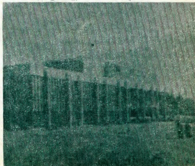
Oombelewa oompe dhongangahangano yaa-kwaLuther oompe ndhoka tadhiti longithwa ngashingeyi mu-Geneva.

Oshifo osha tala kutya, ha oonkondo dhOmuluudhe, nohadhOmutiligane tadhiti vulu okuwilika onkalathano yokukalamwenyo kwetu, ihe oonkondo dhaKalunga adhihe (Gods Power) nohole yopaKalunga ayike ndjoka ya fuluka mesiku lyeyumuko lyQ-mukulili tayi vulu oku tu fala monkalo yuumwayinathana.