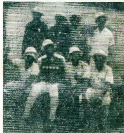
Tse momina yaKombata, okwa li tu na oshithuthi shuukalinawa notwa ningi ethigathano enene "African First Competition" shoka shaningwa eti-11.7.1971. Oosipana adhihe dha li methigathano ndika odha li po omulongo. Ndjoka tayi monika mefano oyo ndjoka ya mono esindano Iyekopi.

"Aalongi ayehe yomepangelo aatiligane, okuza nena ndjika kehe gumwe polwe, na gandje komulongi pamwe naye omuluudhe uuthemba auhe te u pumbwa. Shika osho ashike eopaleko Iyiinima mombili mevi Iyetu."