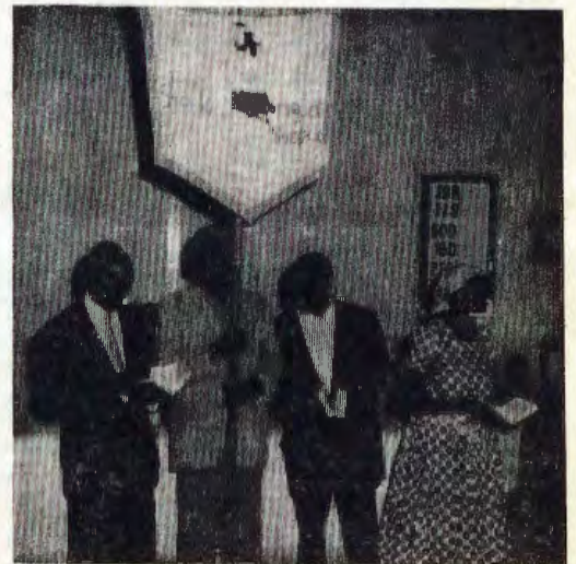
MOhalushu ebandela lovanyasha okwa li la faduka po novakulupe, eshi ve li nyeka ko noimaliwa. Tala nhumbi tave lifele nalo. Ei oya li onghedi yokwoongelela ovanyasha oimaliwa.