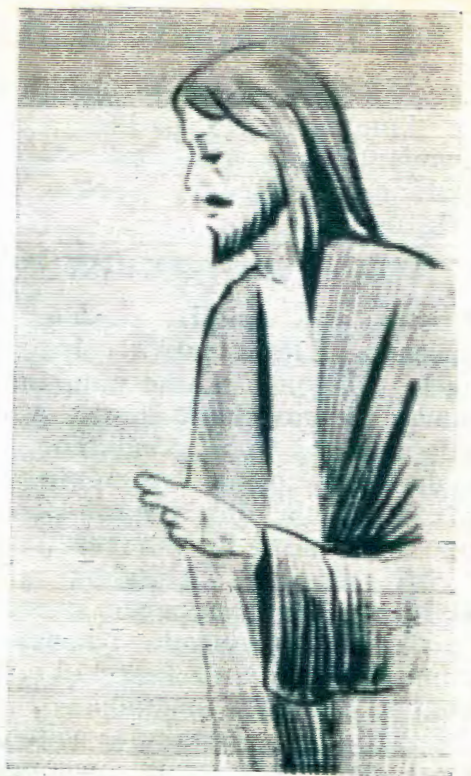
Jesus ta ti ongame nde mu ithana muye ko, ne mu imike iiyimati.