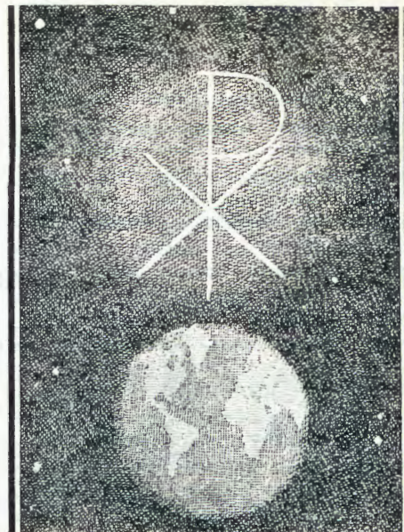
Aagreka edhina lyaKristus oye li thaneke ngaaka.