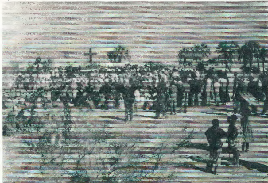
Mo 1960 okwa li oshituthi oshinene pOmandongo ayehe otaa monika mpaka ya taalela omushigakano moka mu na esindano lyongerki

Omadiladilo nomapopyo okwa li taa lyata apa naapenya, eshi taku fanekwa omutumba wovanhu, ee-