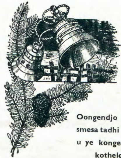
Oongendjo dhaKrismesa tadhi ku hiya u ye kongerki. Ino kothelela.

Olye ngoka te tu kumike omukumo gu thike mpaka? Kaku na omuntu, nando na kale omukwaniilwa gwoshilongo oshinene nongele omuyamba gwiinima oyindjiyindji, nongele ofule nenge ependa, ta vulu okupiitha mokana ke oohapu dhi thike mpaka. Oshoka oye ke shi gwaaluheluhe, ihe ogwomasiku gowala. Nongele oku na omuntu, uugoya we tau mu piithitha mokana ke oohapu dhi thike mpaka, olye mbela ngele ke shi Kalunga awike? Otse aantu ihaa tu lwedha okwiimbandeka nokutumbula: Yaye ngame, otandi ku uka peni. Osho wo tse otwa penduka notatu ende tu na uumbanda womaludhi ogendji, twa tila notwa limbililwa. Oto ende to tala hwiya-ka nenge pombanda moluumbanda. Osho to itala nkene montulo yoye omu na oonyata dhomaludhi dha ningi etilithi kungoye noto ende wa tila enima lya tya ngaaka. Ihe kankama koshipala shaKalunga.