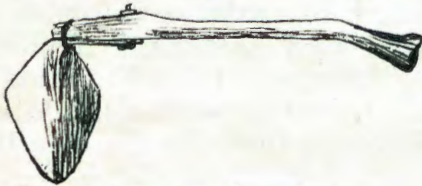
likongela etemo kuyele.