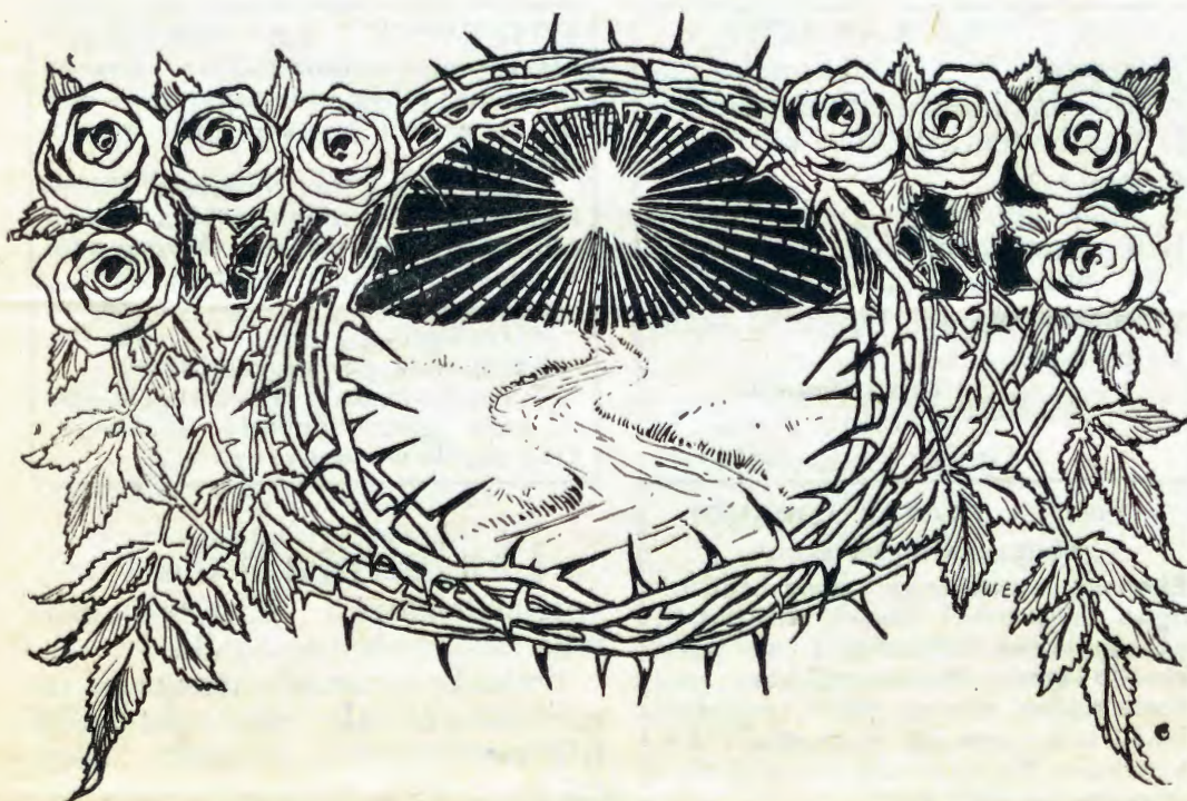
Mokati komangande miihwa moka omuntu a kanene, Kalunga okwa longekidha ondjila yuuelele.