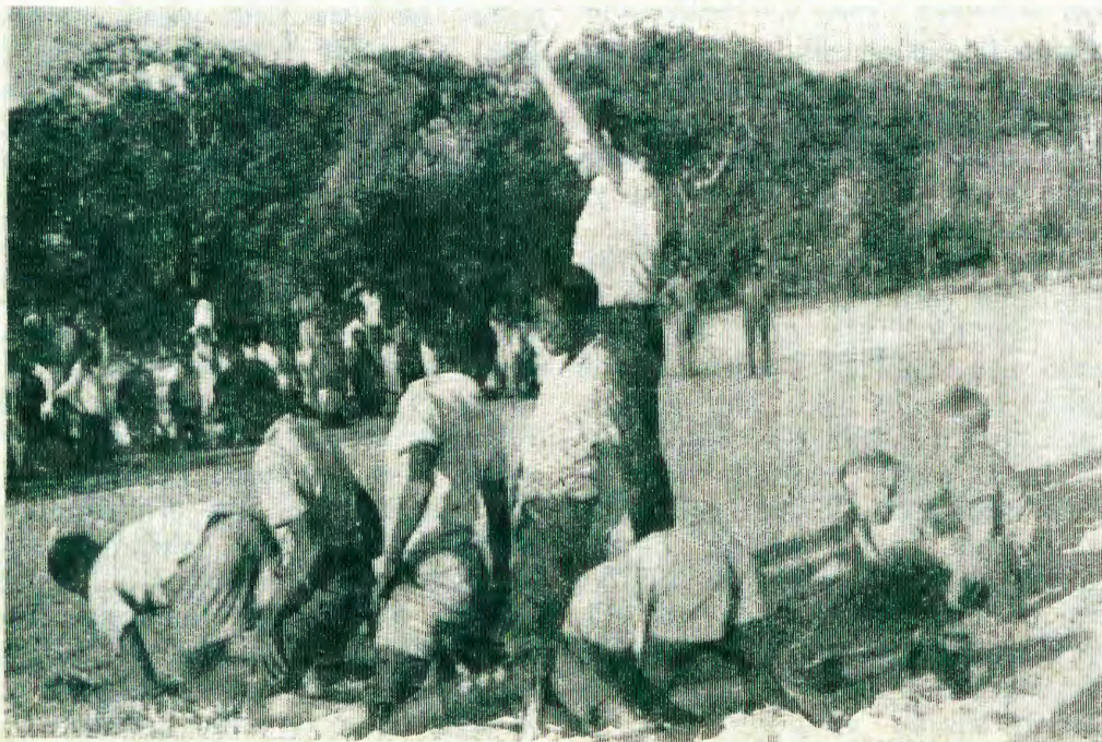
Aanona aadiginini naapenda mboka wo ye na aakuluntu ye na ehalo nelalakano aanona yawo ya ndjange oyo haa mono ompito okukala montanda. Aamatyona mbaka oya li ya kala mOupundi kOnguediva numvo. Omusamane Seppala okwa li omuwiliki gwawo momaudhano.