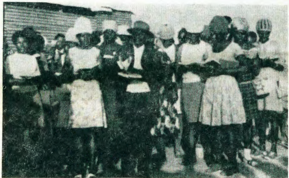
Aawiliki oya thikama taa imbi omaimbilo na.ido opwa li ekudhilo enene. Oonkondo dhevangeli odhi vule ekudhilo lyomuntu.

Oshinyangagongalo eha lya simana shili, eha moka omusita ota kala mo nokugalikanena egongalo nongerki ayihe. Moka wo tse akriste tatu ihempululile oondjo dhe-