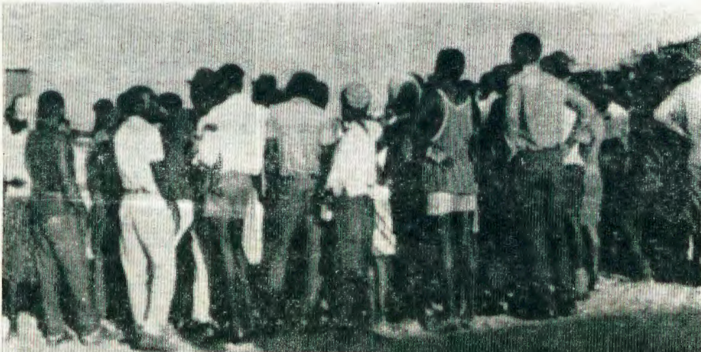
Omaimbilo gaawiliki oga li ga hili aapulakeni oyendji ngaashi taa monika mpaka, ombinga yimwe. Konima yeuvitho okwa uvika omawi gepandulo.