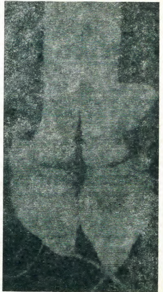
Omutima gwoplastika osho tagu mo- nika gwa tya ngaaka kombanda.

Ou wa longifwa fiyo opaapa owa longwa muArgentina, kundokotola Domingo Liotta. Omutima oo owa longwa u fike konyala pwaau wo- lela noitopolwa aishe oya wanifwa po naanaa. Mofitola yado paife otau kosho R17,850.00.