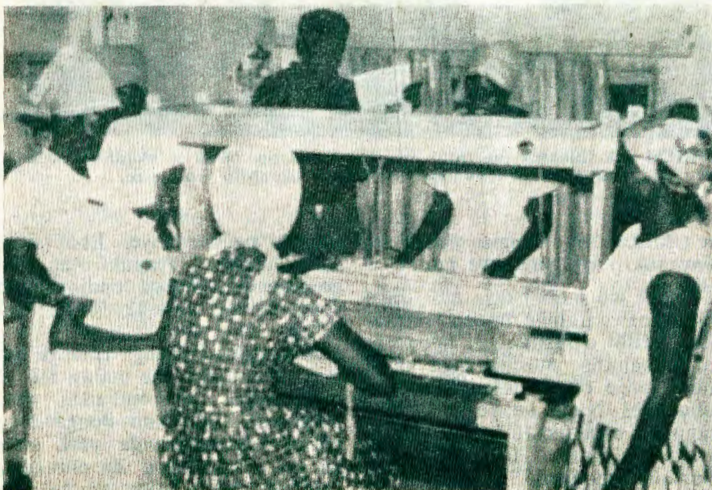
Aalongishina taa tala noku nyanyukwa shono eshina tali shi longo notaa konakona ayihe membo lyeshina