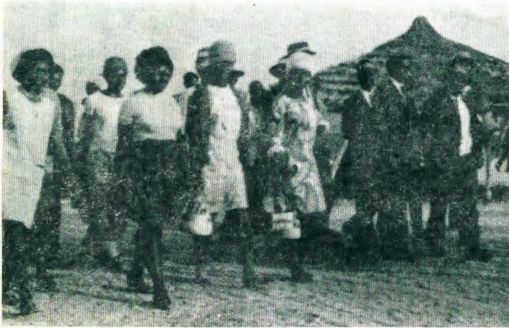
Aawiliki yaagundjuka oya monene ompito oku ka talela po olukanda lwa-Ndjondjo.

Iigongi oya kutha ko aagundjuka noyomongerki yetu kombepo yokukwatakwa, yohoni noyondjethela, onkene okugongela aagundjuka pethimbo ndika kape na we uumbanda wokutila omatokolo omanene.