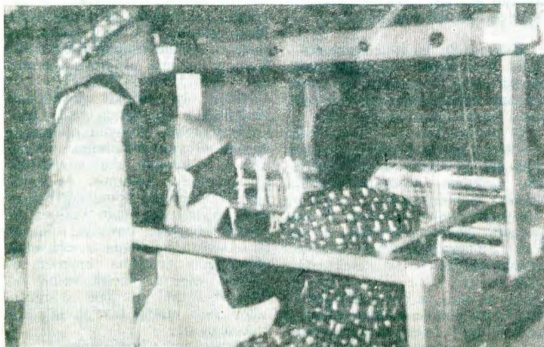
Aalongi taa longitha oongodhi dhomayuvi melandulathano

Otandi ku tseyitha kutya, masiku kwa shi, masiku kwa tende kushoka inoo mona nale mOwambo.