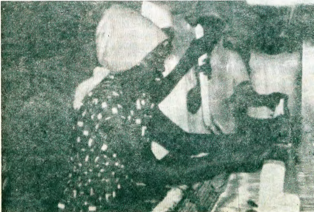
Eshina tali tungu nokuli pamwe naalongi yalyo