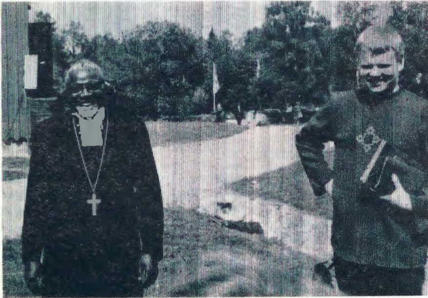
Omumbisofi Auala nomuwiliki gwaayimbi mesiku lyoshituthi shemanya.