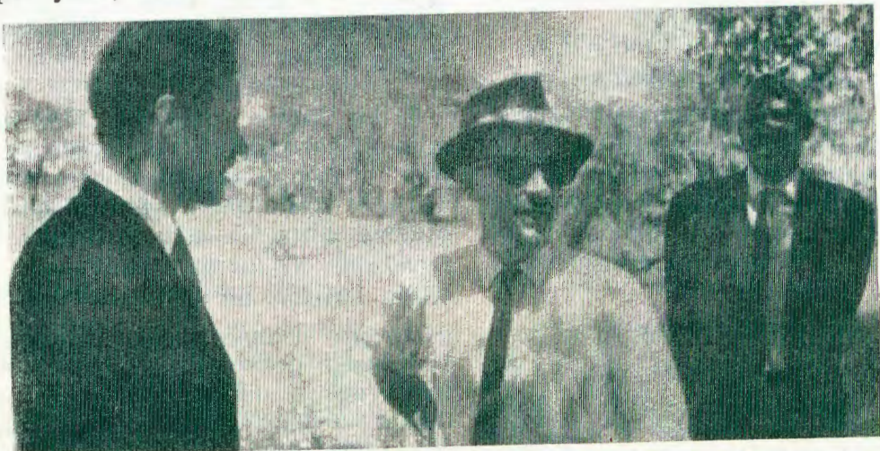
Omukulunhutumwa A.Eirola tava kundafana nakomufala wOukwanyama.

ngenge inandi puka, eelata doilya 200, eexuxwa 38, eengobe 19, oikombo 8 noimaliwa R80. 64, i telekwe opo ovakwashivilo aveshe va lye. Ova ninga omatwali omo mu noikulya neengudu da tukulilwa omatwali. Opa li etwali lomalenga, lovatumwa lovalongi, lovapofi, lovanangeshefa, lovahakuli, lovakwawnghala nolomulyeete.