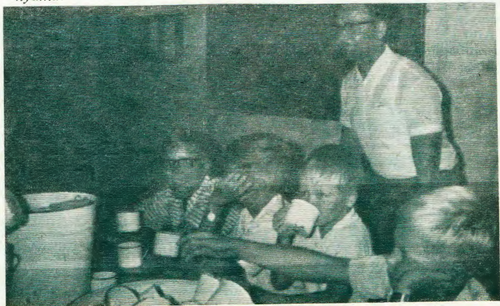
Aveshe va li moshivilo ova telekelwa.