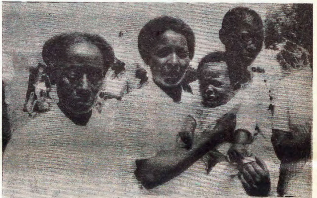
Aashashwa aakuluntu mOmindamba ya shashwa pamwe nuunona wawo uushona pomake.