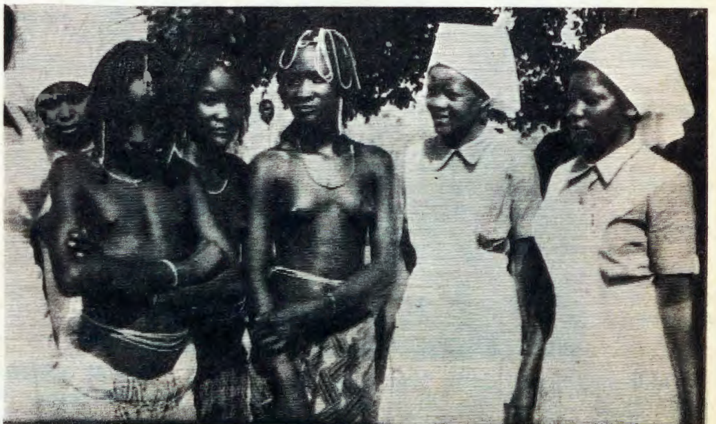
Aakadhona aalongwapangi yokOnandjokwe oya tsakanene naakadhona aakwawo Aandongona noya yi moonkundathana.