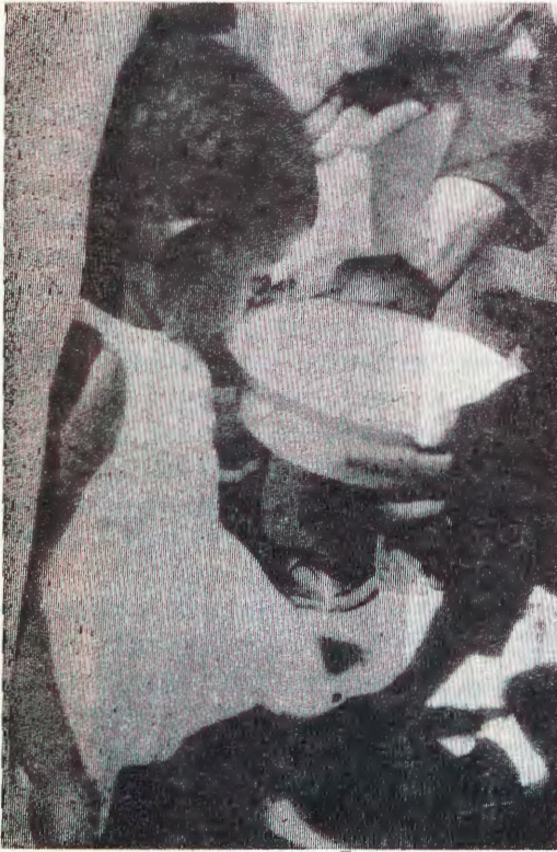
Nepipi ndika wo lyaanona olya shashwa mOmindamba.