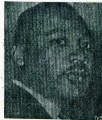
Nakusa dr. M.L. King

Epako laye la ningwa eti-9.4.68. Oshilongo ashishe sha hangana moluhodi eli. Ovanhu omayuvi va kala pefudiko novanenenhu va dja koi- longo ova kala po yo. Oinenenima mehitori laKing oya tumbulwa pepako neendjovo devangeli dehekeleko da tumbulilwa kovapopi omufiyekadi novalilanghali aveshe.