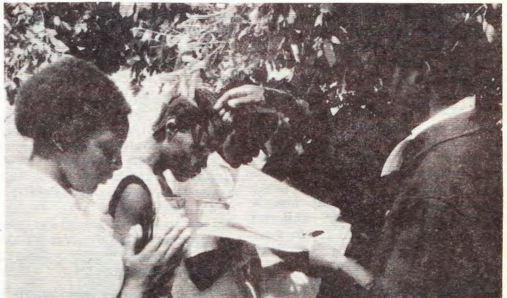
Osho ngeyi eshasho lya ningwa pethimbo lyelongelokalunga mOmindamba.