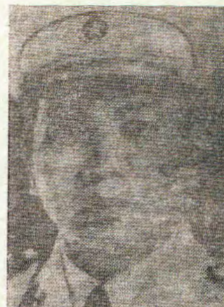
Ou oye omulumenhu ta wilike oita yovakomuni mokulwifa ovaAmerika muSuid-Vietnam, wedina Vo Nguyen Giap. Oye oministeli yepopilo muNoord-Vietnam. Modula 1954 oye a li omuwiliki womatanga oita oyo ya dengele ovaFransa muVietnam. Paife okwa diladilwa, Giap okwa hala a ninge sha vali kombinga yo-vaAmerika.