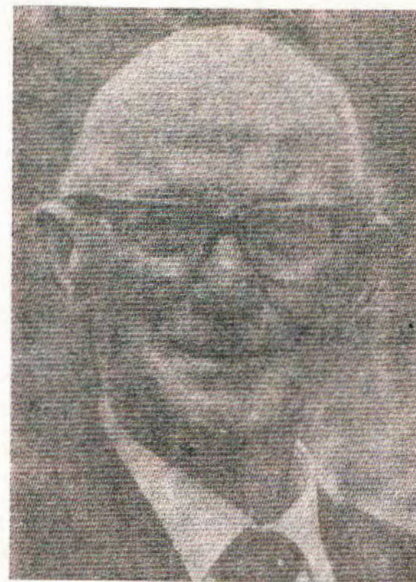
Omushamane Jacobus Johannes Fouché, oye a hoololwa a ninge omupresidente waSuid-Afrika omutivali.

Kwa hokololwa yo kutya, moilando oyo mu noita, omikifi nondjala paife oupyakadi.