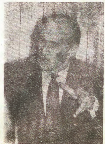
Ou oye Dr. Hilgard Muller, oministeli yoinima yopondje muSuid-Afrika