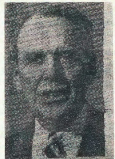
Omushamane Clark Clifford, omu-ministeli mupe wepopilo waAmerika

Engels Engels Engels, Rekene Rekene Engels Rekene Rekene Rekene