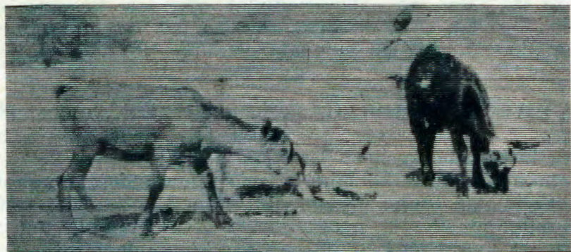
Iikombo oyindji yomOwambo oya li ya nanga kokwenye. Ngashingeyi omwiidhi itayi gu vulu we.