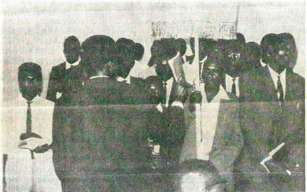
Ongudu yoshoongalele mokomboni muWindhoek.