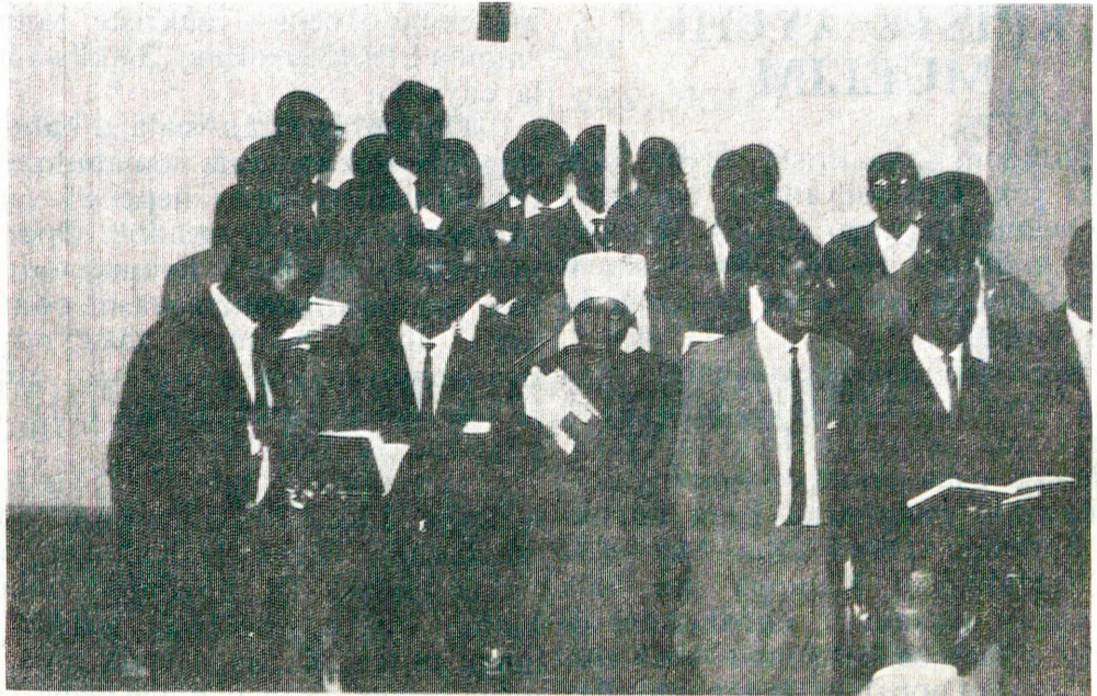
Ongudu yoshoongalele mostata muWindhoek.

Ovanyasha va fiyafana paengudu. Ova imba nde va hokolola. Oupenda ou nau twikile nomodula ipe.