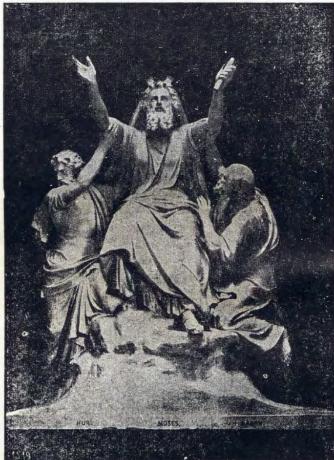
Aron na Hur oya kwata omaako ga Moses noku ga yelutha pombanda, aa-Israel noya sindana.

Omumbisofi ota kala e na iipopowa mu Suomi. Mu Helsinki ta popi ethimbo lyoominute 10. Ota popi ishe-we miilando: Hämeenlinna, Tampere na Turku. Mu Turku ta popi oshipopiwa she moradio yokutuma oohapu (uitsaai). Ota talele po aakuluntu yetumo nota tsikile ku Duitsland na England. Ota tuka noondhila dhi ili nondhi ili. Ota kala miigongi peha lyongerki yetu ayihe, onke a tumbula: "O-tandi pumbwa omagalikaneno gaamwameme, ga hambate ndje."