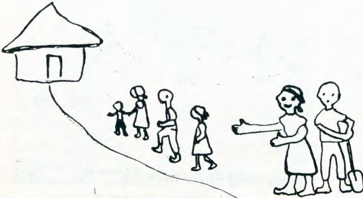
Aanegumbo ohaa longitha okandjugo.

Eeno, otatu pumbwa shili okandjugo ko- kuya kondje, tu kale nawa notwaa taandelithe omavu nuupuka.