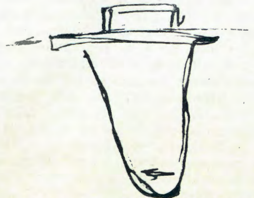
Okaketha kokukuutumba nkene ka tulwa nawa kombanda yiipilangi yokoshilambo.