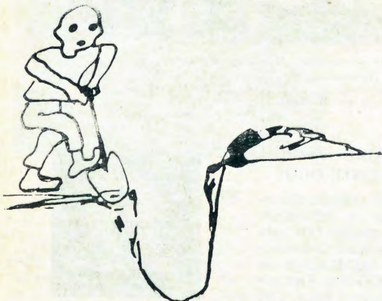
Omusamane ota fulu oshilambo shokandjugo.

AANONA NAANEGUMBO AYEHE OTAA PUKULULWA OKULONGITHA OKANDJUGO yaa nyateke iipilangi noya igilile okusiikila ombululu. - Ombululu tayi siikilwa nawa opo oondhi dhaa mone ompito okutaandelitha omavu.