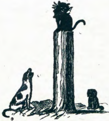
Olye omusama mefano ndika? Okambi-shi nenge okambwa? Tu pulathaneni wo mukukala nooyakwetu

Omushamane Ian Smith, oministeli yotete wa Rhodesia okwa popya kutya, ngenge omahooli aa a fika muRhodesia, otaa eta ekwafo linene nde tava findana nomolwoodi eli lomahooli.