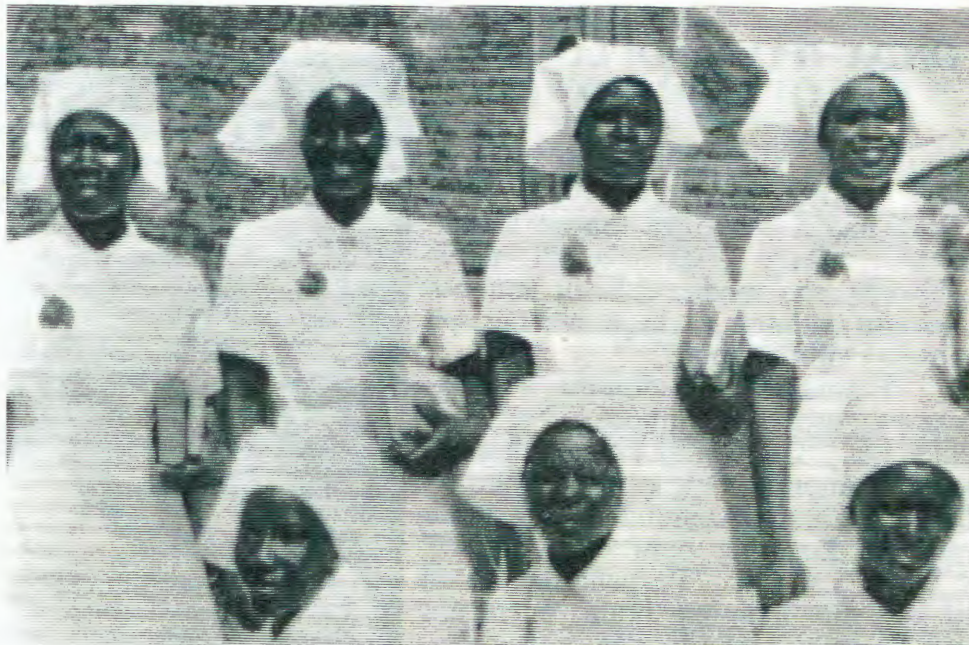
Aapangi oya topolelwa oonzapo dhawo.

linima ayihe osho ye ende nawa ngaaka. Konima aakwazimo sho ya makele okapyu, oya halakana ihe nehabelelo moomwenyo dhawo. Ene-nedhiladhilo olyo: "Longeleni Omu-wa nenyanyu."