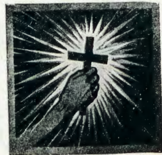
Minikila mboka ya kaka

Okukwatakanitha omitima dhaantu. Omuntu ngele ke na edhiladhilo ndika, ota ende e li awike. Oto vulu okupula: Olye ano nguka? Oye omuntu a shitwa efano lya Kalunga, oshilonga shohole ya Kalunga. Oye tuu lela ngo e nokufatululilwa Jesus. Oye tuu lela ngo e nokutseyithilwa oshili.