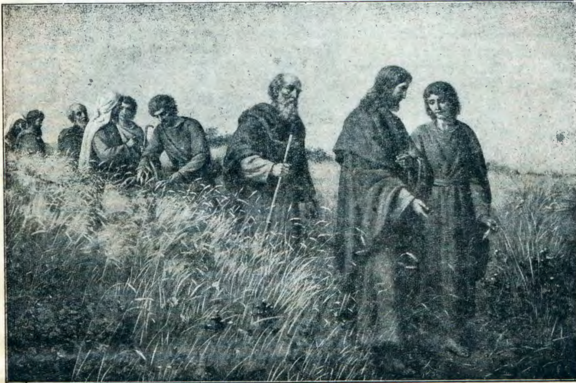
Jesus naalongwa ye taa pitilile pokati komapya etango lyesapati.