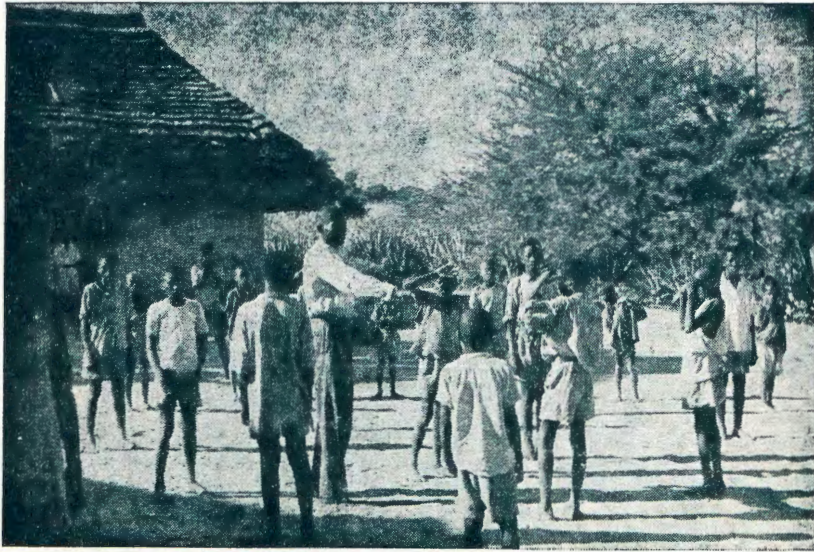
Aagundjuka aawambo otaa pumbwa wo ekwatho.