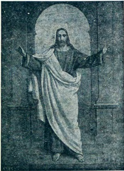
OMEHO GA TAALELA JESUS

Omuwa Jesus okwa lombwele aalongwa ye: "Ongame ndi li pamwe na ne omasiku agehe sigo ehulilo lyuuyuni."