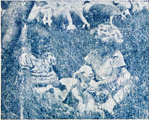
Nepandulo ku The Departement of Native Affairs, Pretoria.