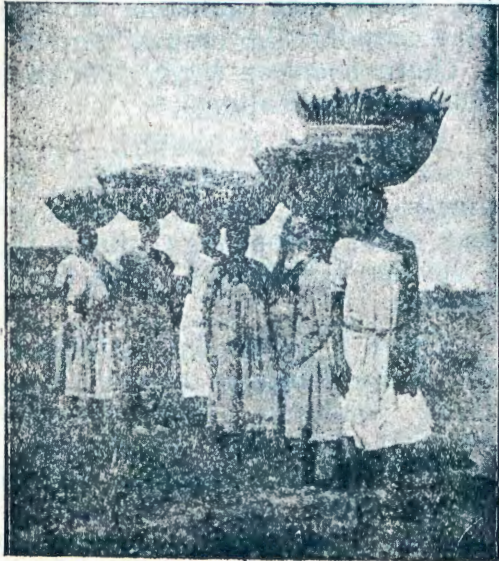
Omahangu taga falwa kolupale.