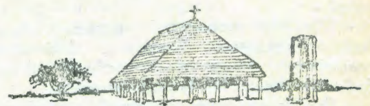
EITAALO TALI AALUDHA UUVU WOMUTIMA.

Nge twa piti mongerki, otatu monathana nooyakwetu notatu tameke okupopithathana. Shoka sho opala. Ihe inatu ningeni oonkundathana dhetu oonde. Ngele tatu kundathana ethimbo ele, otatu dhimbwa shoka twe shi uvu mongerki. Nomondjila yokuya kegumbo omadhiladhilo getu naga kale natango mu shoka twe shi lombwelwa. Osho ngeyi mutse tamu gwanithwa ohapu ndjoka yomomapsalmi: „Aanelago omboka ye noonkondo dhawo mungoye, nokudhimbulukwa oondjenda oondjaduki.