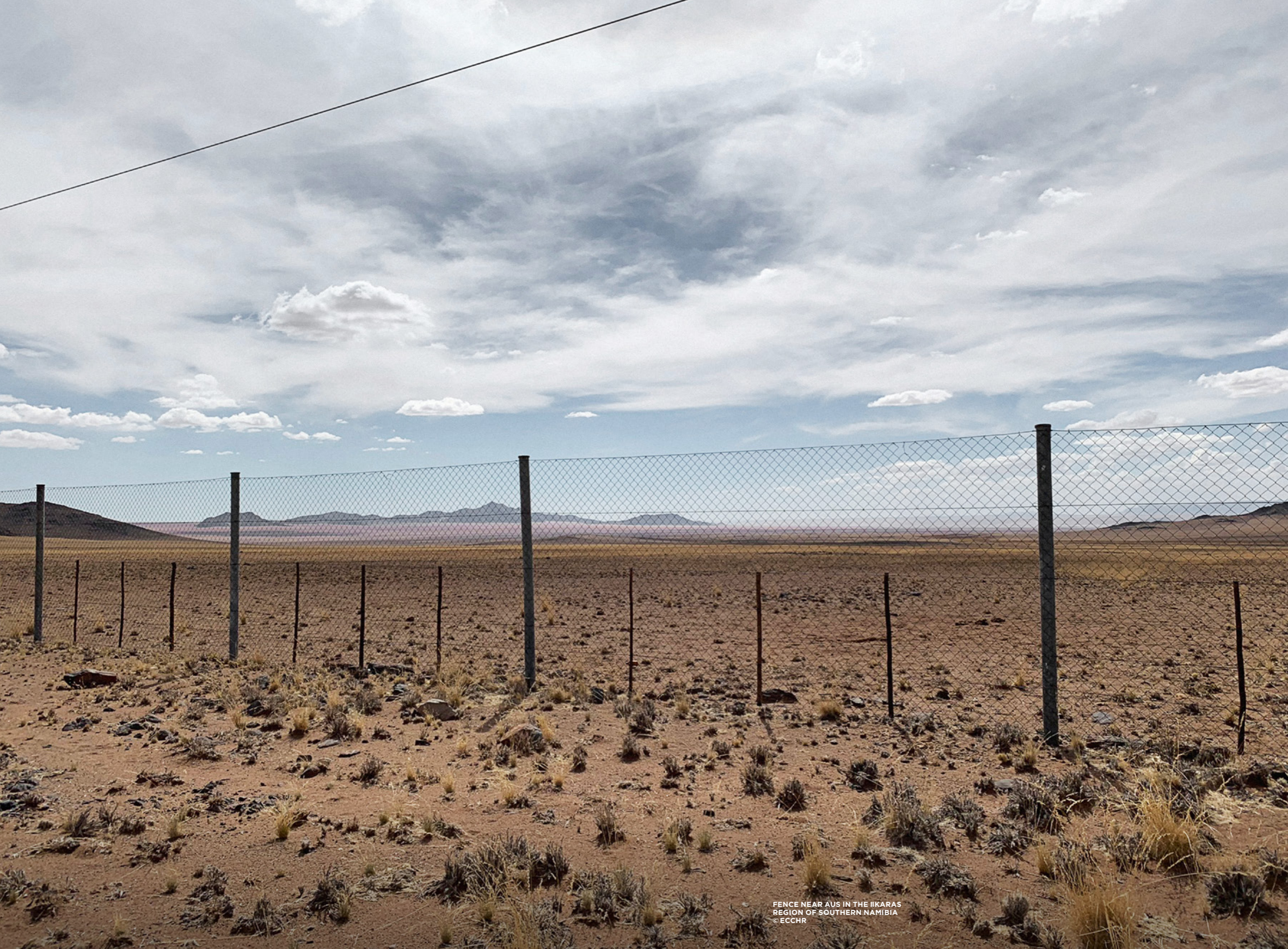
FENCE NEAR AUS IN THE IKARAS REGION OF SOUTHERN NAMIBIA