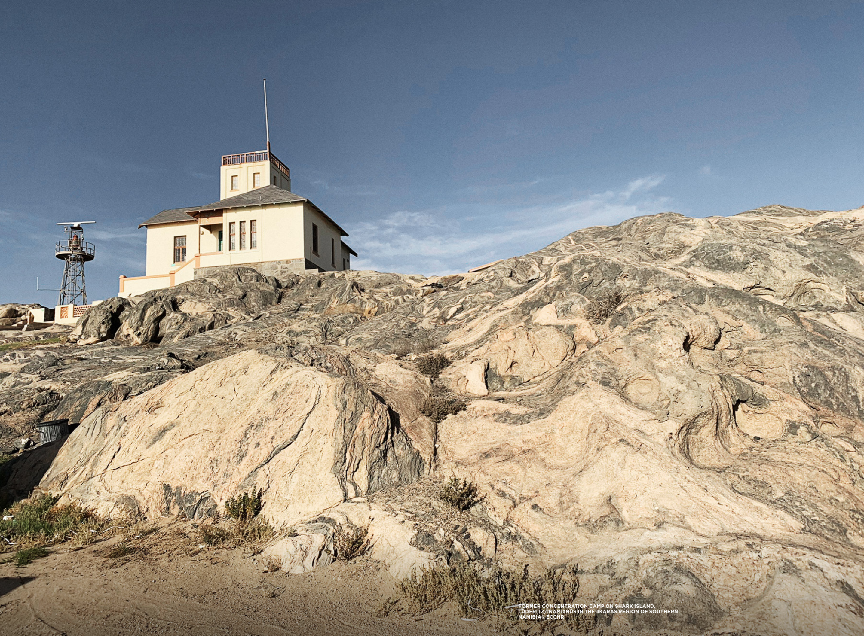
FORMER CONCENTRATION CAMP ON SHARK ISLAND, LÜDERITZ/NAMIBIEN IN THE IKARAS REGION OF SOUTHERN NAMIBIA