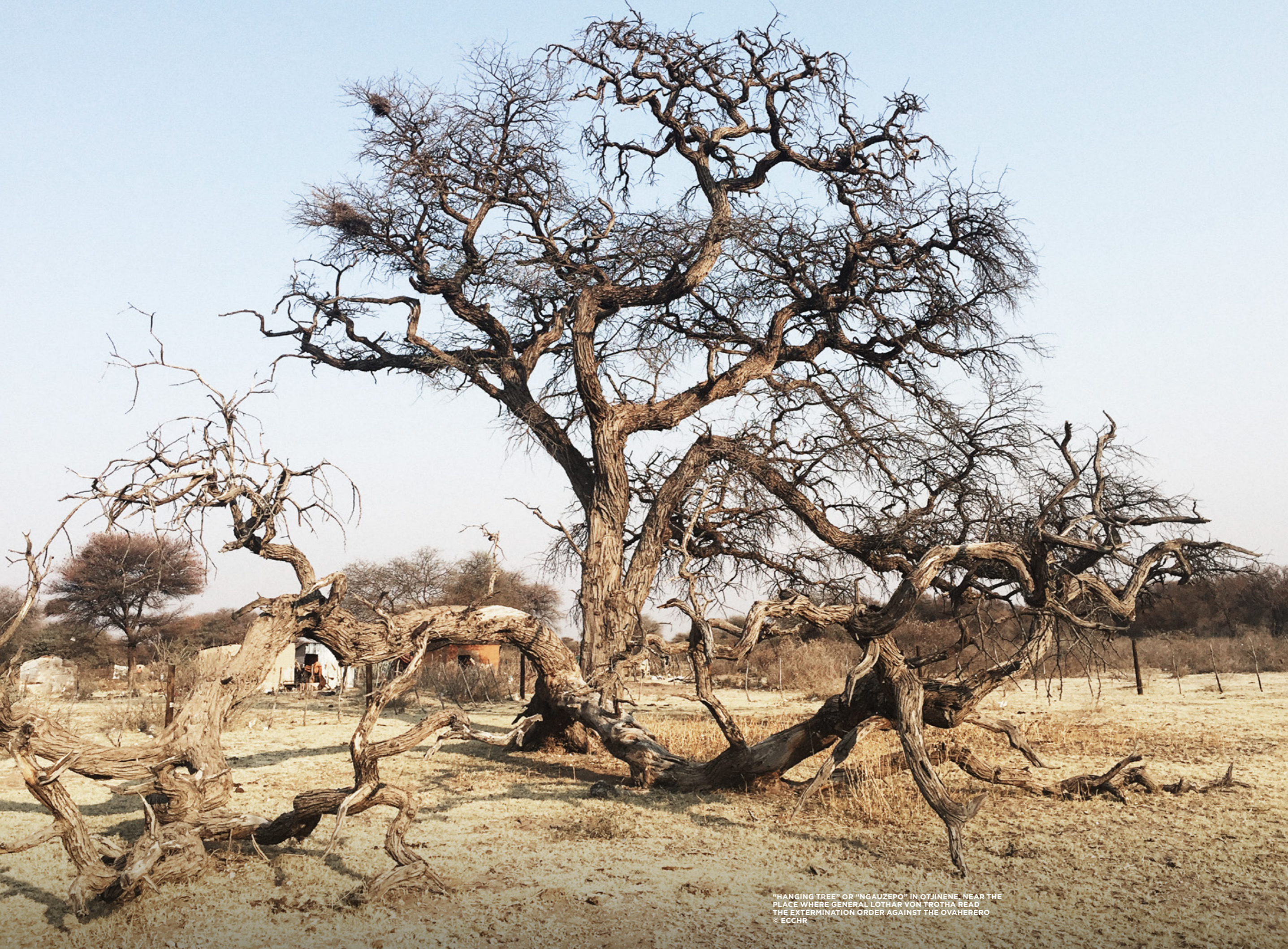
"HANGING TREE" OR "NGAUZEPO" IN OTJINENE, NEAR THE PLACE WHERE GENERAL LOTHAR VON TROTHA READ THE EXTERMINATION ORDER AGAINST THE OVAHERERO