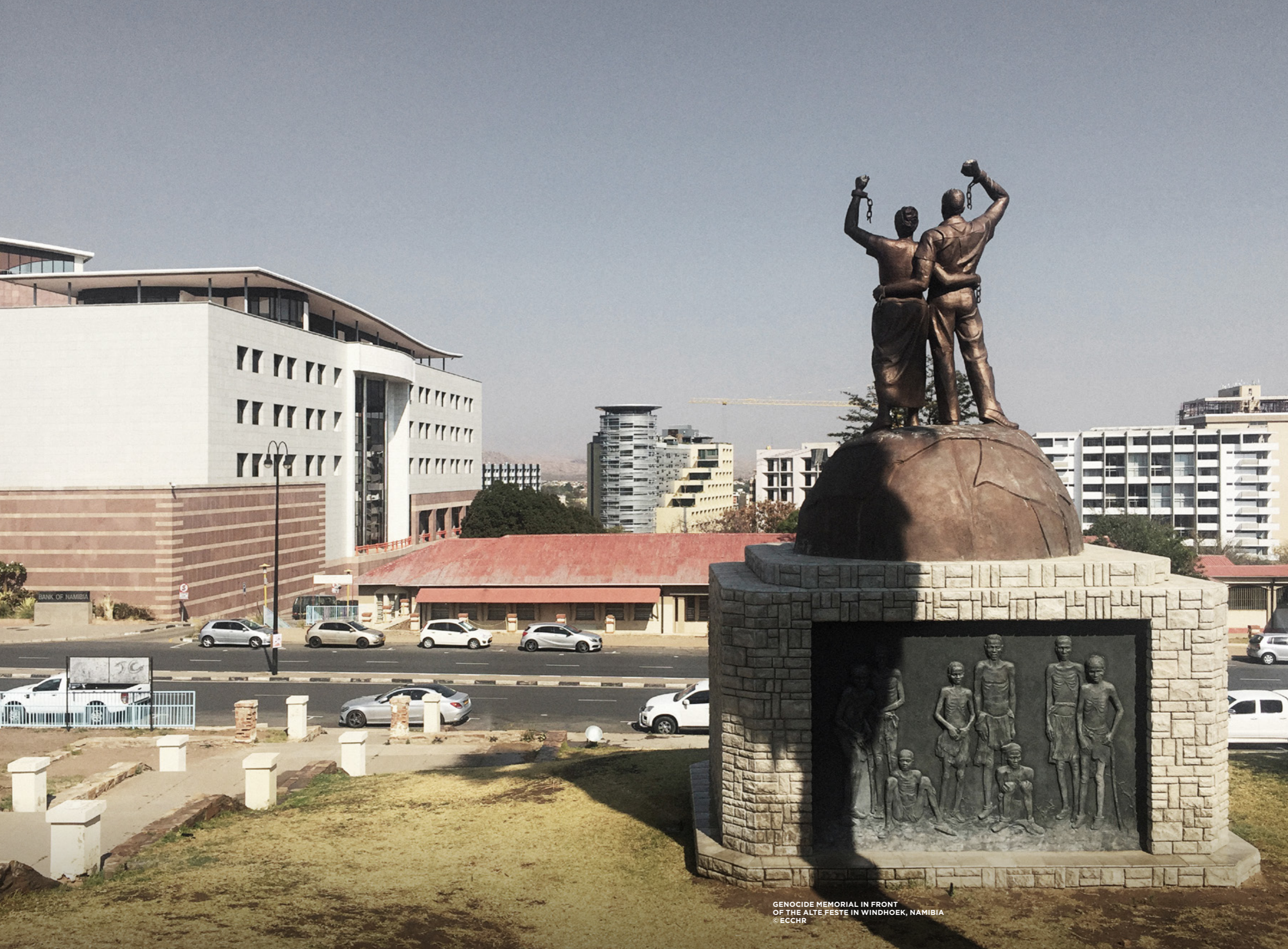
GENOCIDE MEMORIAL IN FRONT OF THE ALTE FESTE IN WINDHOEK, NAMIBIA