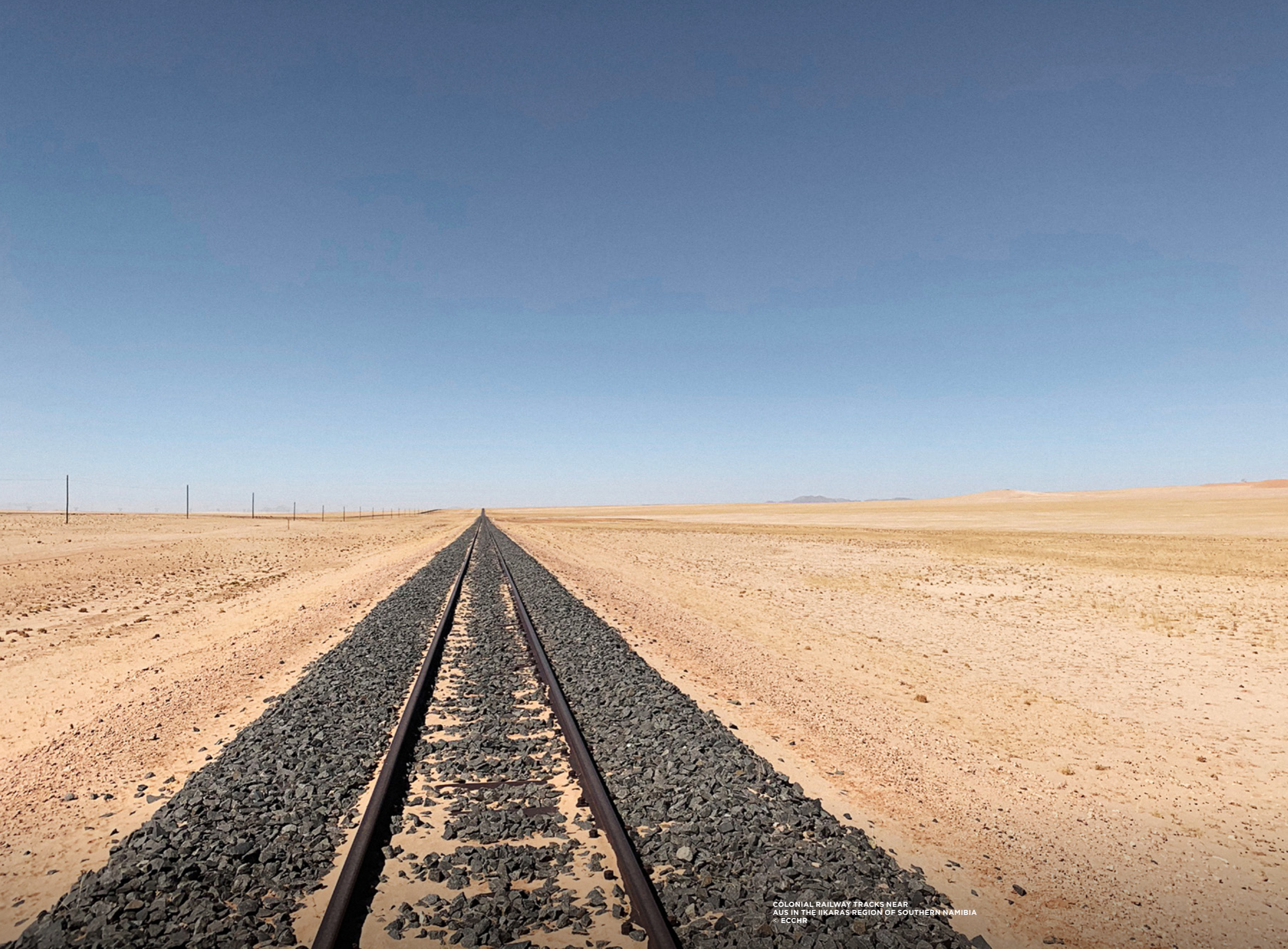
COLONIAL RAILWAY TRACKS NEAR AUS IN THE IKARAS REGION OF SOUTHERN NAMIBIA