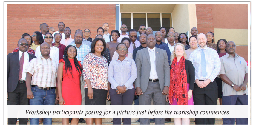
Workshop participants posing for a picture just before the workshop commences

UNAM academics from various disciplines went through the first phase of a grant-writing training workshop conducted at the Main Campus. It forms part of a broader strategic plan aimed at helping academics become more skilled at attracting international research grants.