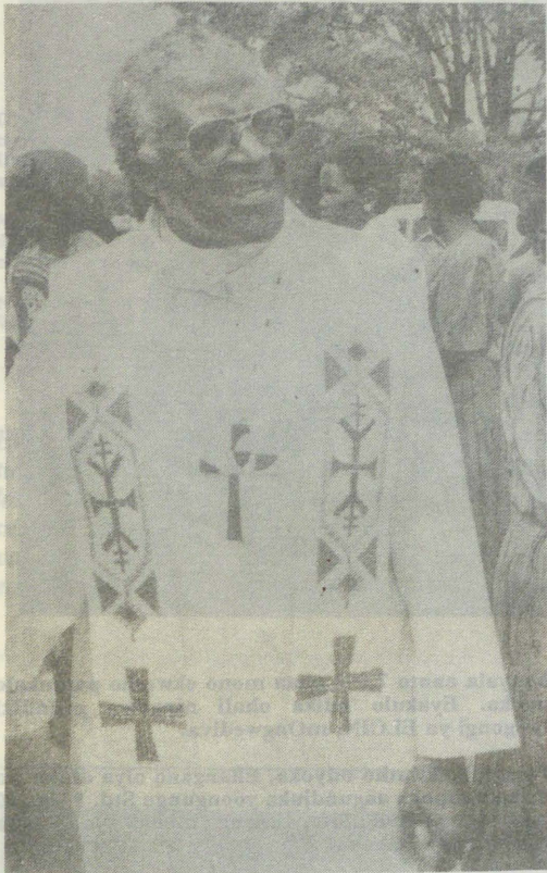
Omumbisofi omukuluntu gwaAnglikana muumbugantu waAfrika, Desmond Tutu ngoka a fala aambisofi ye koshigongi shuuyuni auhe kuLambeth.