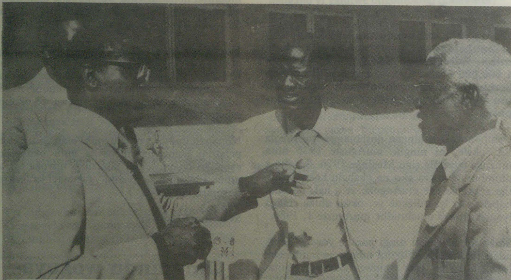
Pethimbo lyomafudhopo, iilyo yoshigongi oya kala tayi tsikile nokutaasina shono ya li nasho moonkundathana.