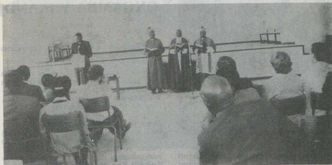
Aambisofi yatatu muNamibia, Aaluudhe, oyo ya li ye egulula oombelewa dhuuthemba womuntu pambelewa.