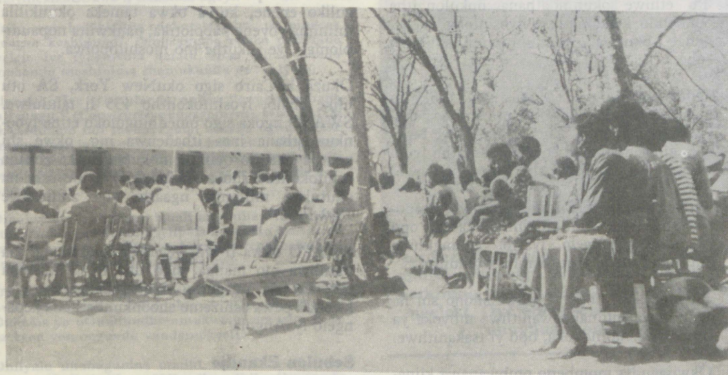
Oshituthitumo numvo mOngwediva. Aagundjuka naanona oya li taa monika oyendji.