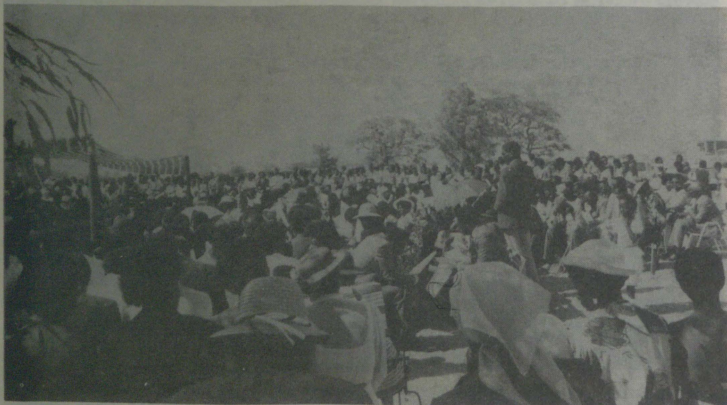
Egwanitho lyomimvo omulongo, Aanamibia sho ya sile moCassinga, olya li lya dhibulukiwa muNamibia nuumvo. Ongundu ndjika oya gongalele mOshakati.

Otwa lolok'okuuda omipaulilo Deendjebo neeboma tadi topa Otwa loloka molwovanhu vetu tu he va na Twe va kufwa keefya doiningilewina Otwa loloka!