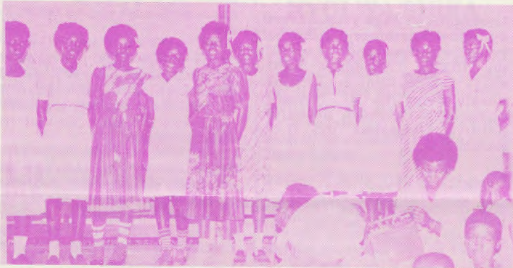
Okangudu kovanyasha vokoKunene (kOkalonga) tava imbi. Oulapi vatoka momitwe ova li va havalekwa ovakriste aveshe vokoshitai shaKunene ku ELOC