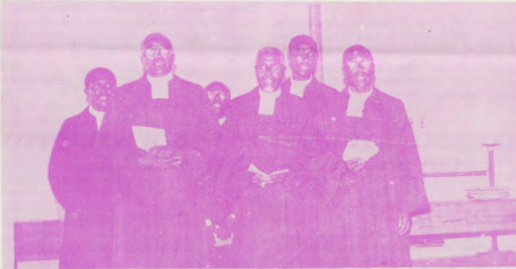
Ongudu yovayapulwa tai imbi. Meimbilo lavo omwa li tamu udika oitya ei: "Onda tokola, ame ou Omwene tume nge."

Ovalumenhu vahamano, veedula dopokati, ova yapulilwa oshilonga shoufitaongalo mEngela eti 18.11.1984; konima eshi va kala tava tekulilwa oshilonga osho menongelo lovayakuliongalo mEngela okudja muMaalitsa neudo.