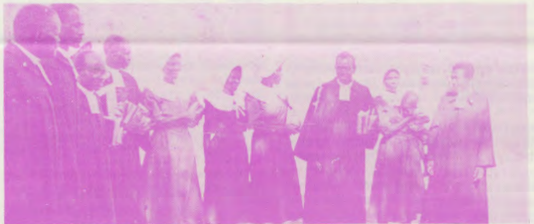
Efano eli otai ulike ovayapulwa ve li novakulukadi vavo

Oshitai shaKunene ohashi fatululwa kutya ombinga yomeni lomulonga waKunene muAngola oyo ya palafana eengaba naNamibia.