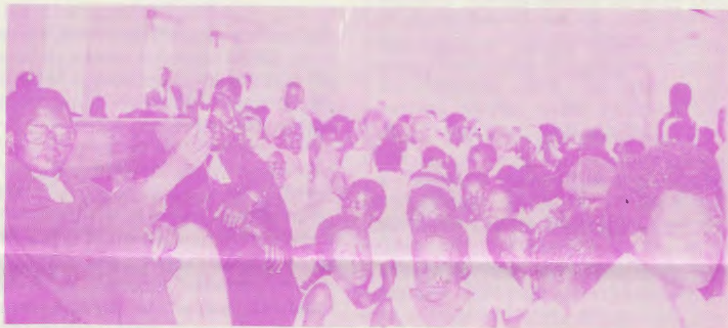
Efano eli otali ulike ombinga imwe yovapwilikini vomaimbilo