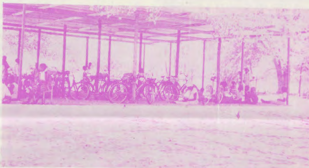
Pefimbo eli, ombashikela oyo osheendifo sha fimana pokati kaAngola naNamibia. Konyala keshe efiku ovanhu tava di kuAngola otava tauluka eengaba va londa eembashikela, opo ve uye va shingife oinima yavo muNamibia (kOdjoini ngaashi ovaAngola hava ti).