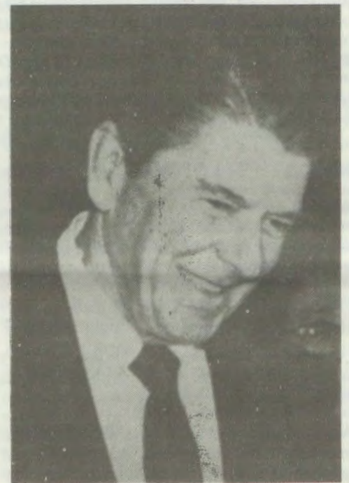
Omupresidende R. Reagan (73)