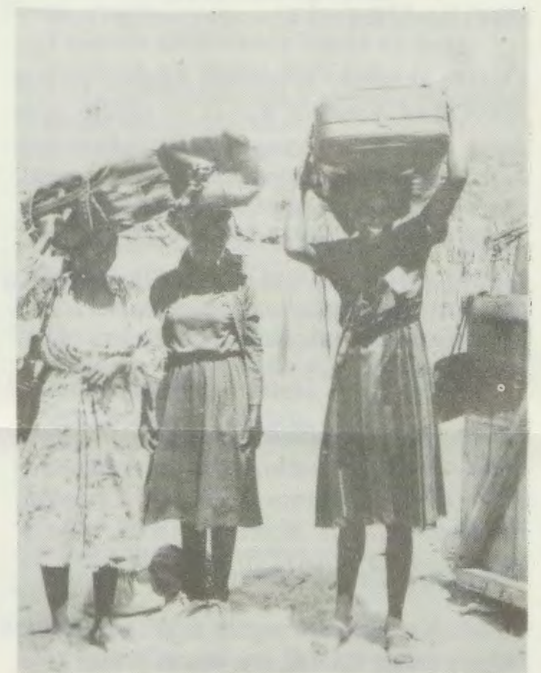
Iilyo yoshigongi shookuume kaakongindjila tayi thiki moshigongi.

Esiloshimpwiyu alihe lyontanda mwa kwatelelwa omalweendo gawo, olya ningwa koshikandjo shuukongindjila.