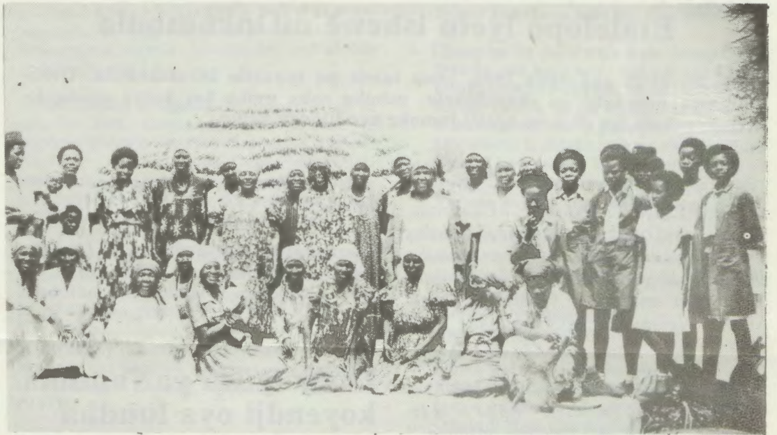
Ongundu yaaselekadhi pethimbo lyontanda yawo, mOshaatotwa, Onandjokwe.

nokiikandjolonga ayihe mOngeleki okwe yi dhimbulutha yi humbate moshimpwiyu shayo aaselekadhi.