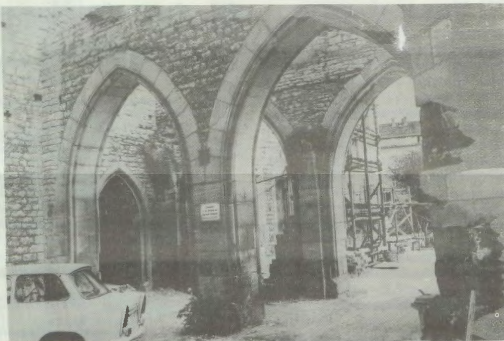
Omiyelo dhokuya mondjugo yaaikaleli yaAugustine, muErfurt