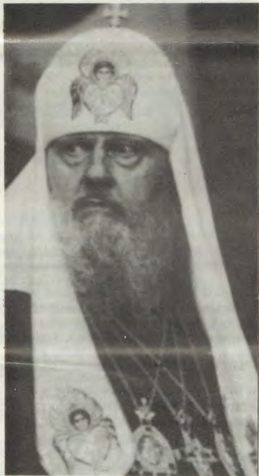
Omizalo dhaambisofi yAakwaluther, otadhi yooloka kashona kundhoka dhaambisofi yOongeleki dhilwe. Mpaka otapu monika omuzalo gwomuwilikingeleki yaKatooolika kokuuzilo (Orthodox).

Oshigongingeleki oshitine shOngeleki onkwa-evaangeli paLuther yahangana muSuidwes Afrika/Namibia (VELKSWA) osha gongala mehala lyiigongi ya ELOK mOngwediva, okuza 14-17.7.1983 kohi yoshipalanyolo: