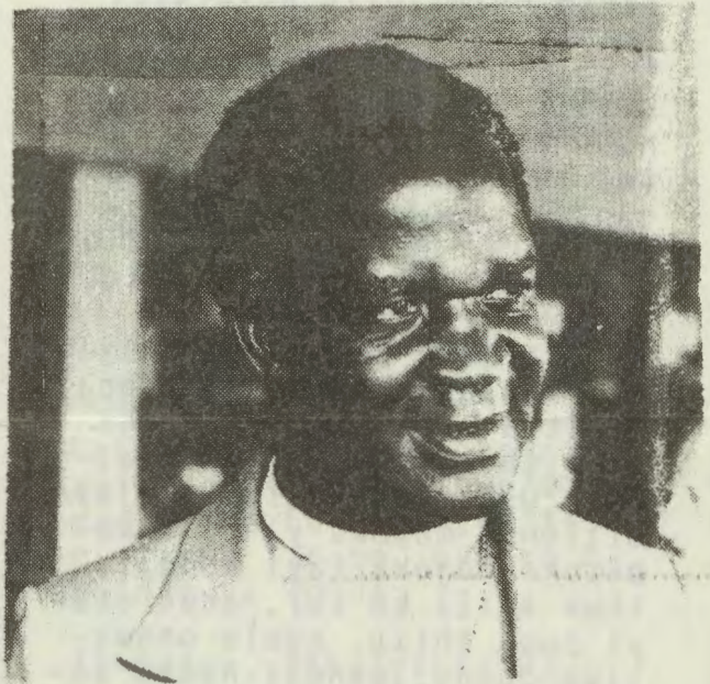
Omupresidende gwa LWF, omubisofi Josia M.Kibira, gwomuTanzania.

"Oomiliona noomiliona dhaantu ngashingeyi oye li ashike pashinanena, ya longeka noya putuka; ihe aapagani yothilu. Onkee ondi na ethaneke kutya, peha lyokuholeka shoka itaashi vulu we okuholekwa, Ongongahangano mokulongelakumwe nomahanganogalwe goongeleki, oye na okwiitula mo monkambadhala yokwe vaangelithulula, Europa naAmerika nokutala shoka shi shi okuningwa okukondjitha elongo kehe muuteologi kehe mboka wa hala okushundula nokupilika omanyolo omayapuki. Tala kep. 4