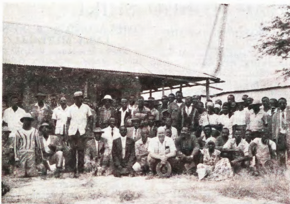
Oshigongi shotango shaanangeshefa 1964, mOwambo.