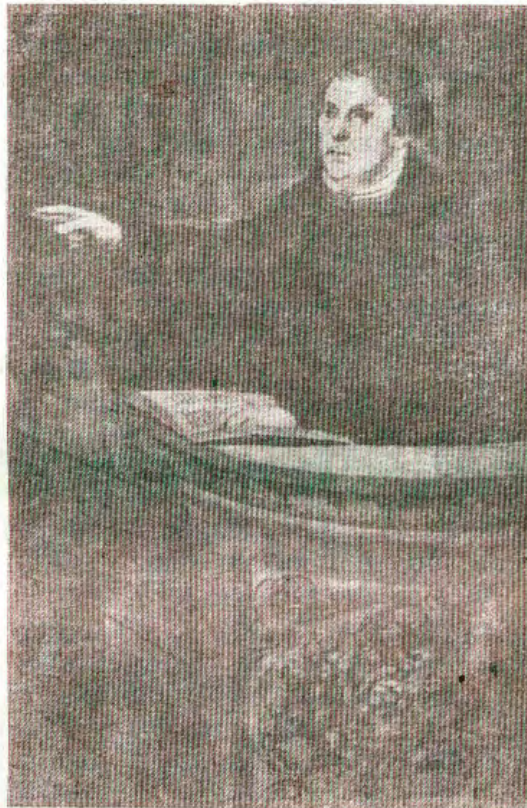
Omusamane Martin Luther oku li moshuuvithilo, ota monika mpaka mefano ndika ekulu.

Aadiakoni yotango mongerki yetu, mboka ya putudhilwa oshilonga shawo, otaa ka tameka iilonga yawo momagongalo petameko lyomumvo 1967.