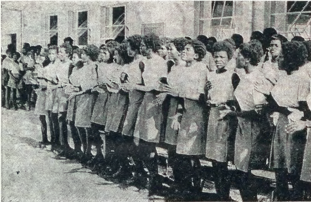
Aanasikola yOsekundo yaKahao taa hambelele moshituthi sheegululo lyomatungo gawo gosikola yawo 1977.