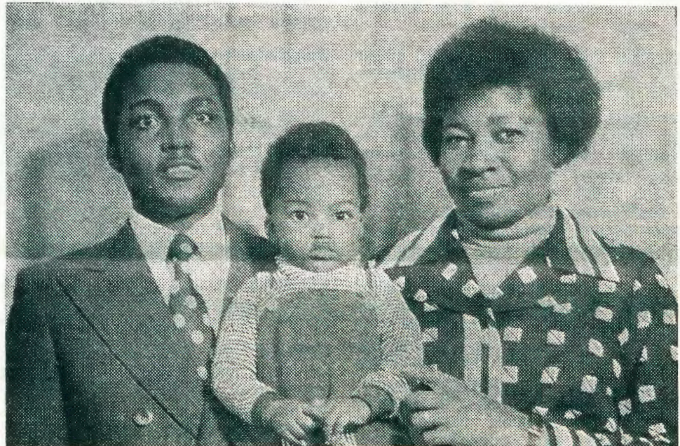
Aatumwa meme natate Heita nokasheeli kawo Rakkell. Selma Lawanifwa okantoweke kake mo methano.

Oshiwana shOvasenegal osha putuka unene mokuyeleanifa nafye melongo. Nonande epelesenda di fike 25%-30% ashike odo di shii okulesha nokunyola pavalulo nda mona xuuninwa. Ovagalimo moshilongo ove fike peemiliyona 5. Osho naumwe. Omadina avo ovo: Stig-Olof