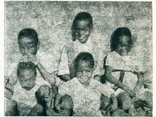
Omapulo gaanona naga yamukulwe