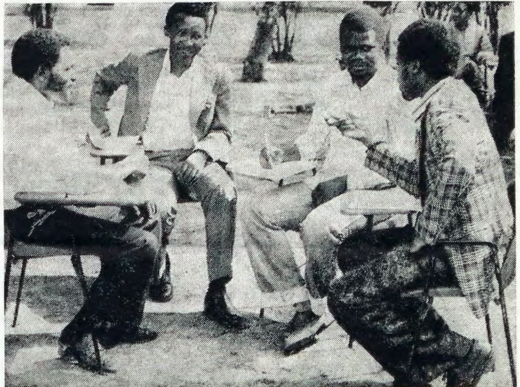
Ethimbo limwe aaniifo ya za kwAfrika lyokOlukadhi nolyOpokati oya li ya gongala muungundu nokukundathana iinima mbyoka tayi gumu iilonga yawo. Popepilela nefano kolumoho otapu monika amushanga gwOmukwetu, ngoka wo a monene ompito yokukala moshigongi shoka.