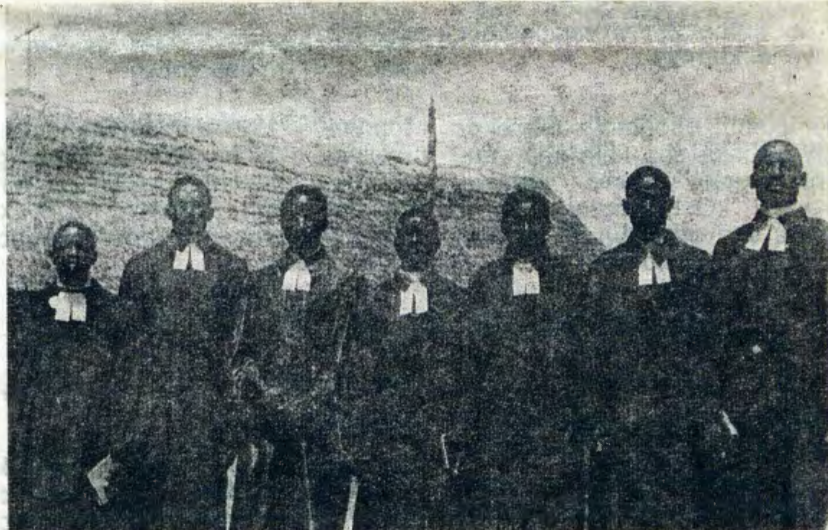
Aasita yotangotango Aawambo 7, mboka kwa li ya thikama powalitali mongeleka yaNiipa, 1925 noya yapulilwa oshilongashuusitagongalo.

Methimbo ndiyaka omo omagongalo gehanganotumo lyaSoomi mOwambo na Kavango ga longekidhwa ga ninge ongeleka yimwe. Omalongekidho sho ga pu nEkotampango nOmauthompango ga tungwa, Epangelongeleka olya gongala koKavango muRupara muApilili 1954. MuRupara omo Epangelongeleka lya dhimbulula kutya edhina lyongeleka ndjika oli na okukala: Ongeleka Onkwaevaangeli paLuther yomOwambokavango (ELOK). Epangelongeleka olya hiya Oshigongingeleka omumvo 1954, mEnge-