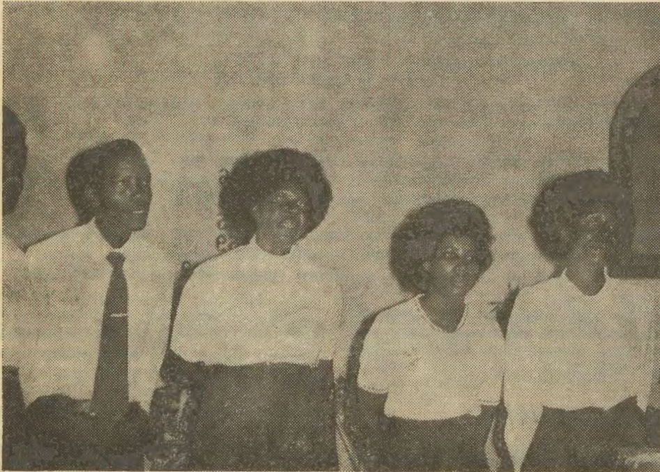
lilyo yongundulwiimbo lwOngeleka mbyoka ya zile kOngwediva kOskola yUumusika wa Elok oya kala tayi towaleke oshituthiyapulo noondjimbo tadhi tunduluki-tha omwenyo.

■ Ongulu ndjika ya fa ombila, otayi ningi ehala lyokufumvika mo oondjo. Mpoka pu na ongeleka opu na egongalo, naampoka pu na egongalo opu na Kristus. Ongulu ndjika oyo Betesda, ongulu yohenda mono shaa ngoka te ya mo ta silwa ohenda kOmuwa. Otempeli ndjika otayi mu ithana, opo mu lalekwe nuuyamba. Otamu tungwa meha ndika nOmasakramendi agehe Omayapuki. Ndika edhiya lyesilohenda, shaa ngoka te ya mo, ngele a ninga oomvula 30 muulunde, ota yogwa mehala ndika.